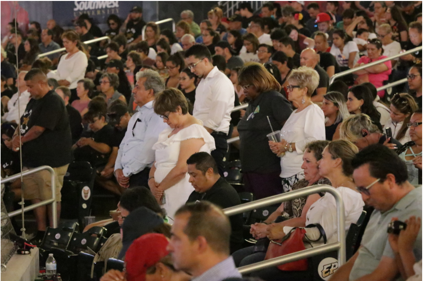
Participants bow their heads in prayer at an Aug. 14 memorial held at Southwest University Park in El Paso.

"I've seen over the years as we've reached out to waves of migrants that come through El Paso, how there is a tremendous spring of solidarity to draw upon in this community," he said. "The effort to get volunteers and donations to help us receive migrating people with dignity is not especially difficult here. What El Paso is dealing with now in terms of migrants, solar energy, and water consumption is what most communities will be dealing with in coming years. The response is something to emulate."