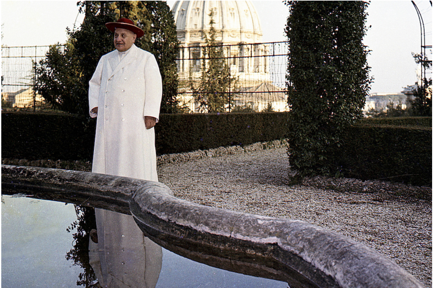
Pope John XXIII in the Vatican Gardens