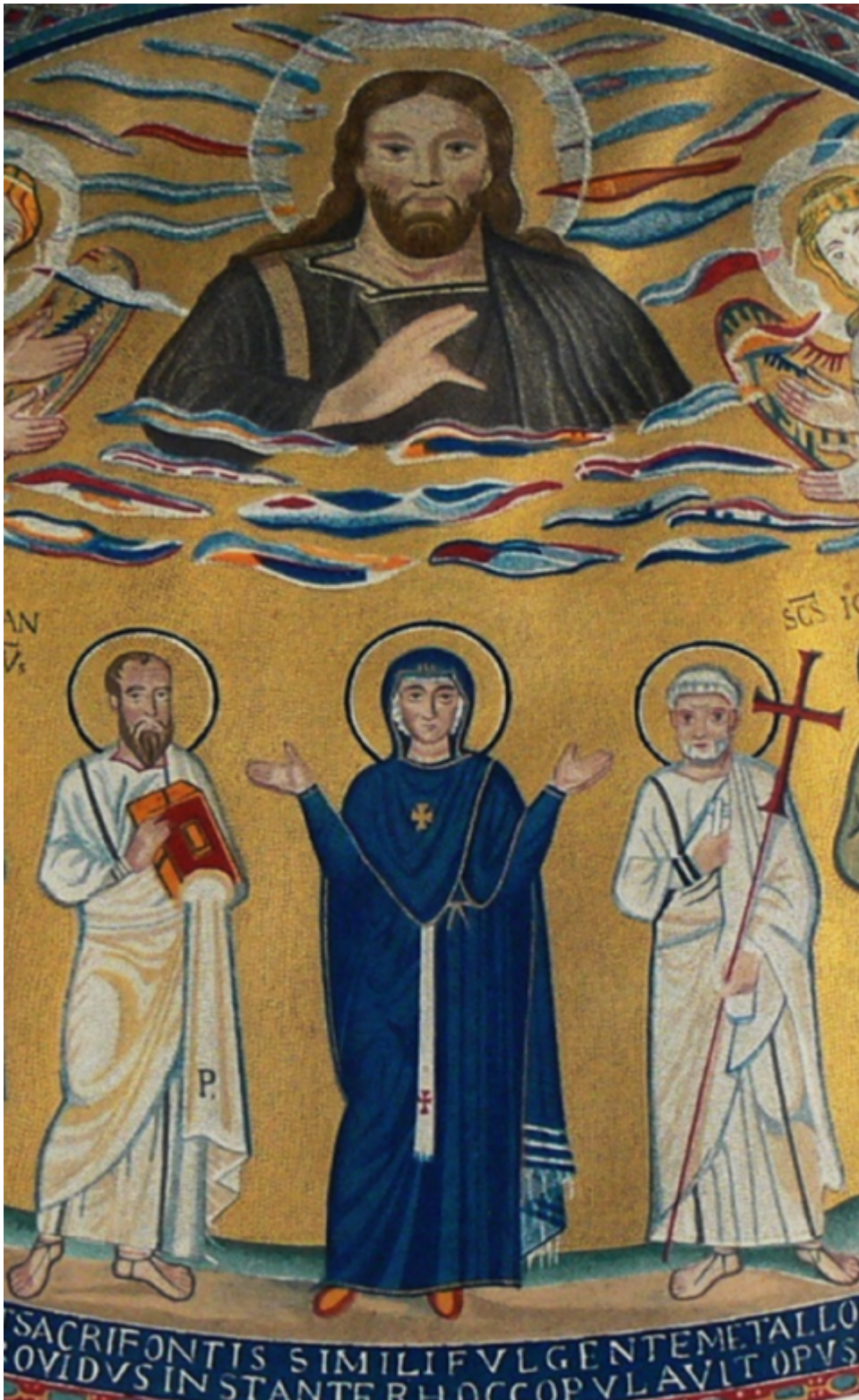
Altar apse mosaic, circa A.D. 650, San Venantius Chapel, Lateran Baptistery; an 1890s painting of the mosaic by Giovanni Battista de Rossi, that depicts Mary wearing an episcopal pallium with a red cross.