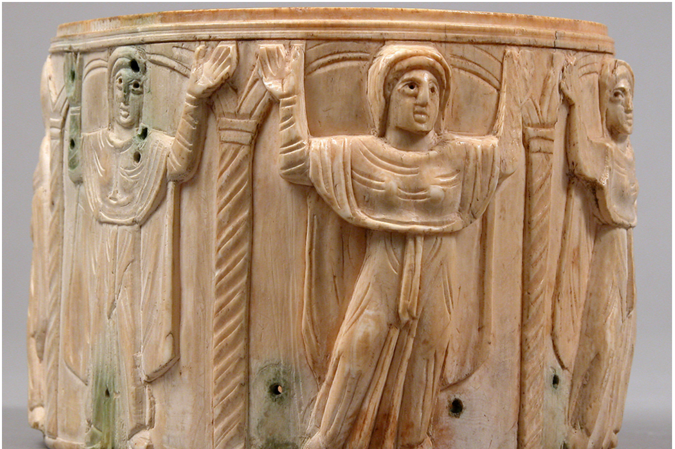
"Pyx with the Women at Christ's Tomb," ivory pyx, circa A.D. 500s, made in Eastern Mediterranean (Metropolitan Museum of Art)

Kateusz believes that the images are significant because they show women and men in parallel roles, their bodies and gestures mirroring one another, and she suggests that this parallelism is indicative of their equality in their liturgical roles.