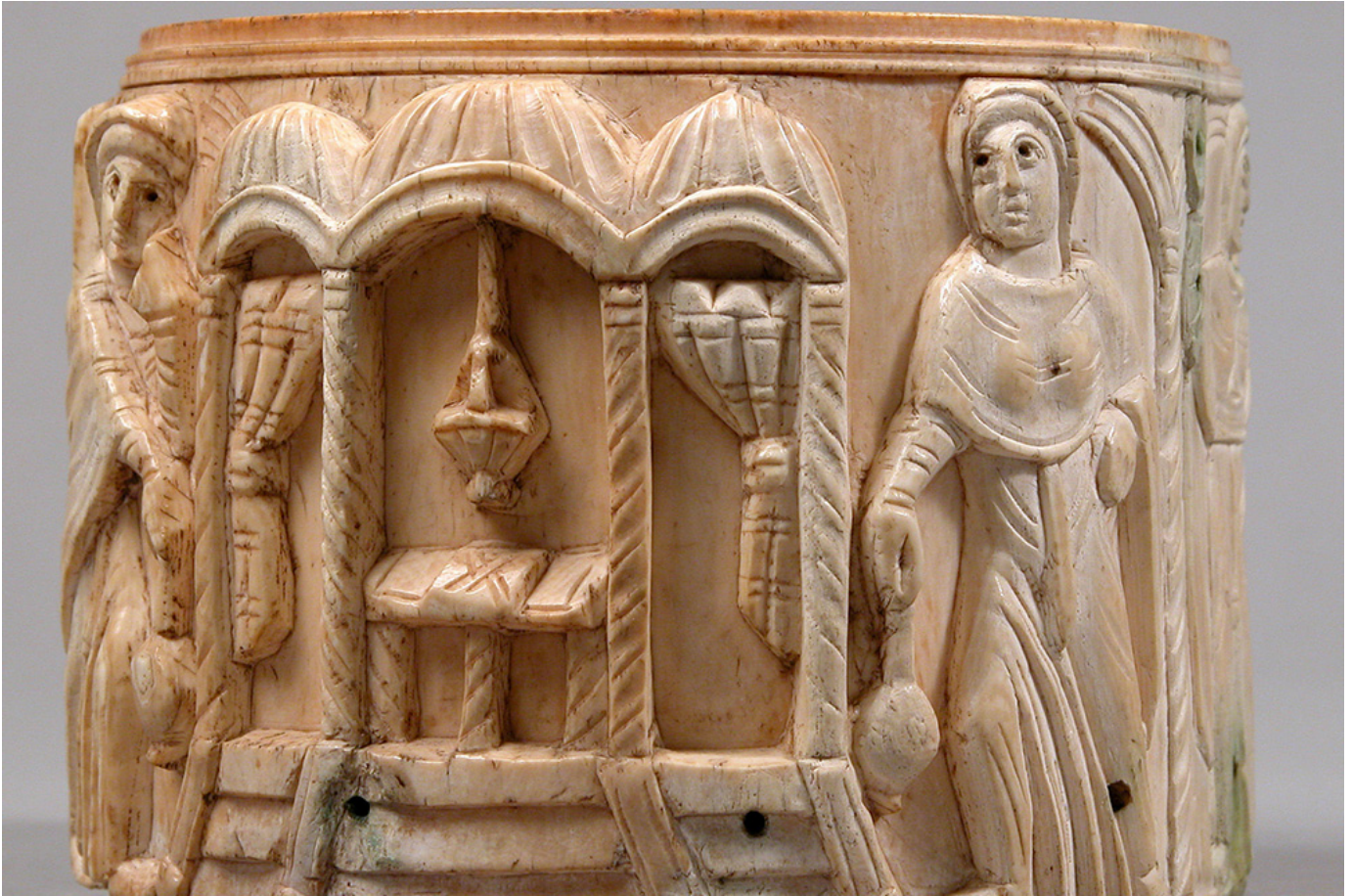
"Pyx with the Women at Christ's Tomb," ivory pyx, circa A.D. 500s, made in Eastern Mediterranean

Virtually no liturgical manuscripts survived from the first seven centuries of Christianity in relation to ordination, lending to a long gap in the historical record. The oldest manuscript describing ordination in the Roman rite, the Ordo Romano , dates from the ninth century, centuries after these three artifacts.