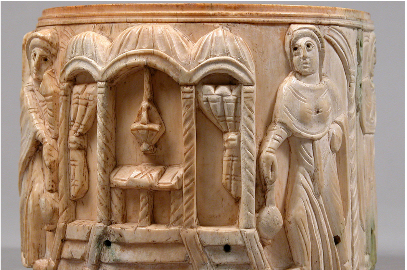
"Pyx with the Women at Christ's Tomb," ivory pyx, circa A.D. 500s, made in Eastern Mediterranean

Virtually no liturgical manuscripts survived from the first seven centuries of Christianity in relation to ordination, lending to a long gap in the historical record. The oldest manuscript describing ordination in the Roman rite, the Ordo Romano , dates from the ninth century, centuries after these three artifacts.