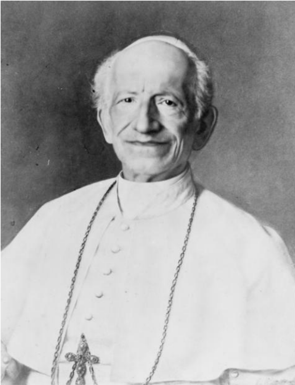
Pope Leo XIII

Even before John XXIII, popes were grappling with new communications technology in this way. Pius XII dedicated an encyclical, Miranda Prorsus , to movies, radio and TV in 1957. And Pius XI plunged the church directly into broadcast media with the founding of Vatican Radio in 1931.