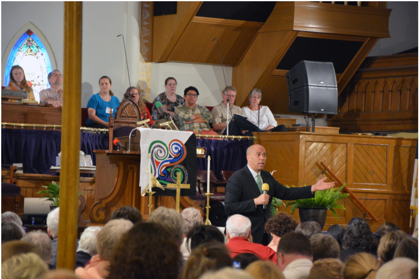
Sen. Cory Booker, D-N.J., speaks to the Festival of Homiletics on May 22, 2018, at Metropolitan AME Church in Washington.

"Today it's the profiling and targeting of Hindu Americans and ascribing to them motives without any basis," Gabbard, a military veteran, wrote in a commentary published by RNS. "Tomorrow will it be Muslim or Jewish Americans? Japanese, Hispanic or African Americans?"