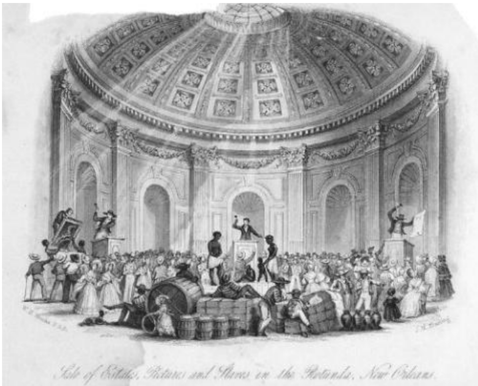
Etching depicting "Sale of Estates, Pictures and Slaves in the Rotunda, New Orleans," 1853

New Orleanians perfected the art of parades over centuries. Funerals with military bands were commonplace as early as the memorial for King Carlos of Spain in 1789. Berry illustrates the initiation of carnival parades in 1857 and how Reconstruction-era Mardi Gras parades featured costumes "with scalding, often racist satire," often mocking Union generals and Northern "carpetbaggers."