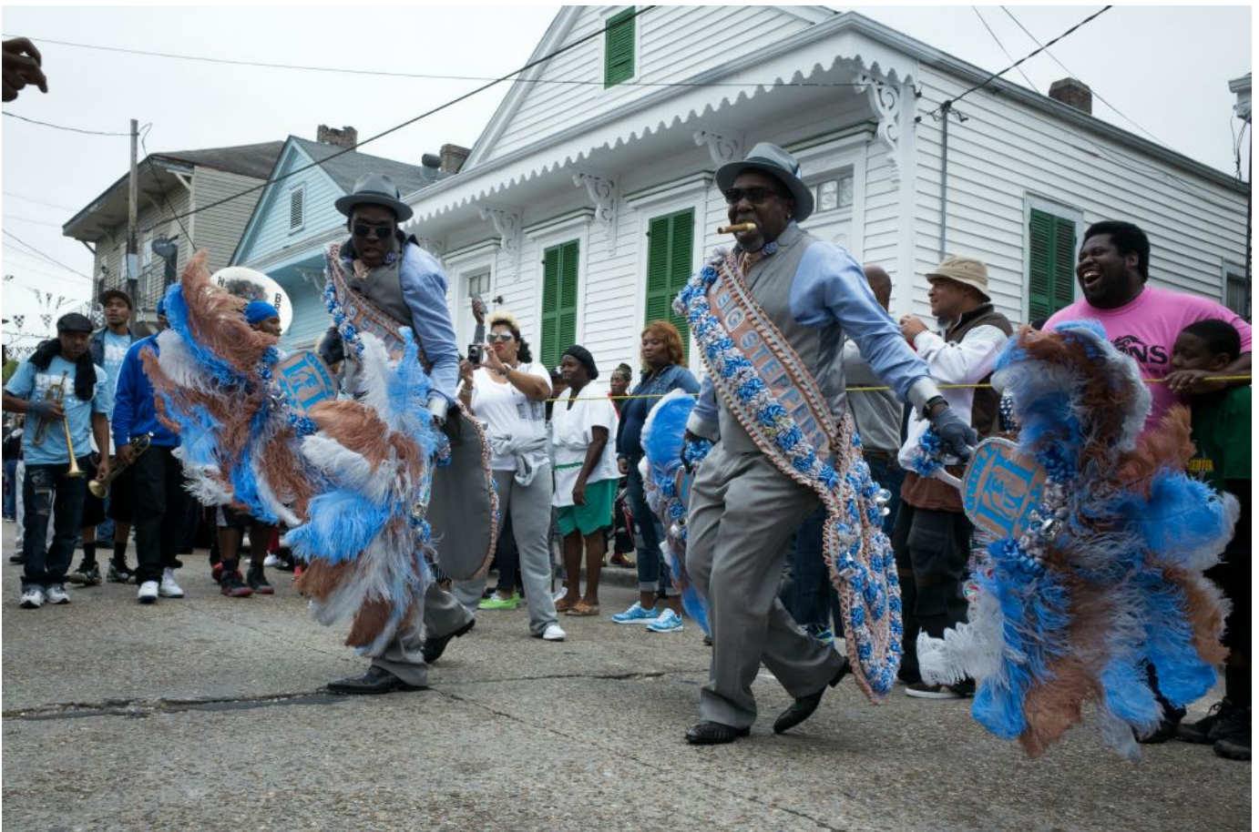
A 2015 Second Line parade in New Orleans

And while slave owners and priests relied heavily upon punishment to enforce slavery, they also allowed slaves to carry their own weapons, be entrepreneurial, work their own gardens, and to hunt, fish, trap and gather fruit to avoid the constant threat of famine. The place we now call Congo Square originally served as a marketplace where African peoples also "used the land to dramatize their past, resurrecting burial choreographies of the mother culture."