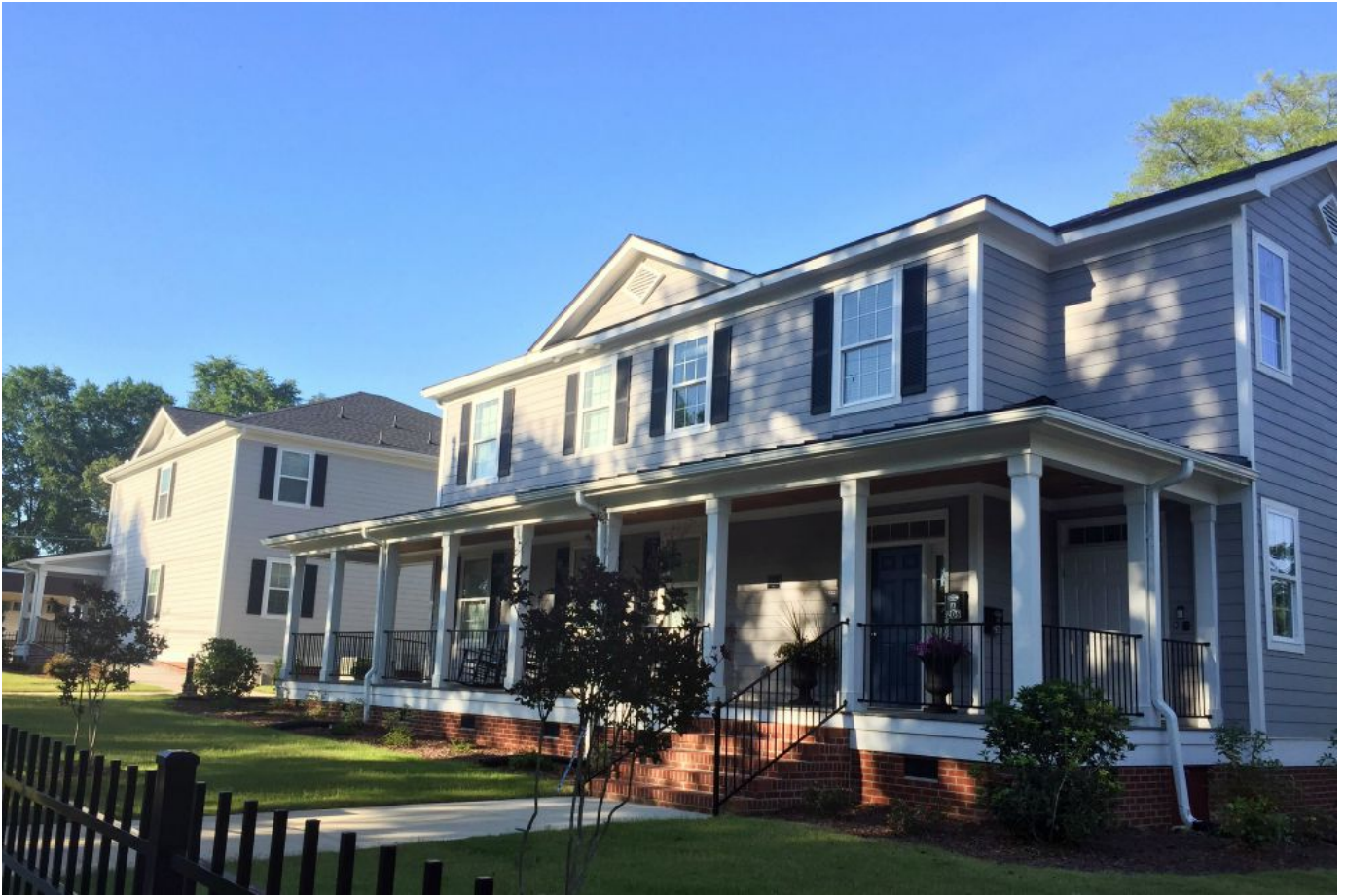
Two of the three Friendship House buildings in Fayetteville, North Carolina

His signature creation was L'Arche, a worldwide network of homes where people with and without disabilities live and work as peers. The influence of L'Arche can be found in Friendship Houses, which have adopted Vanier's core principle of "Eat together, pray together, celebrate together."