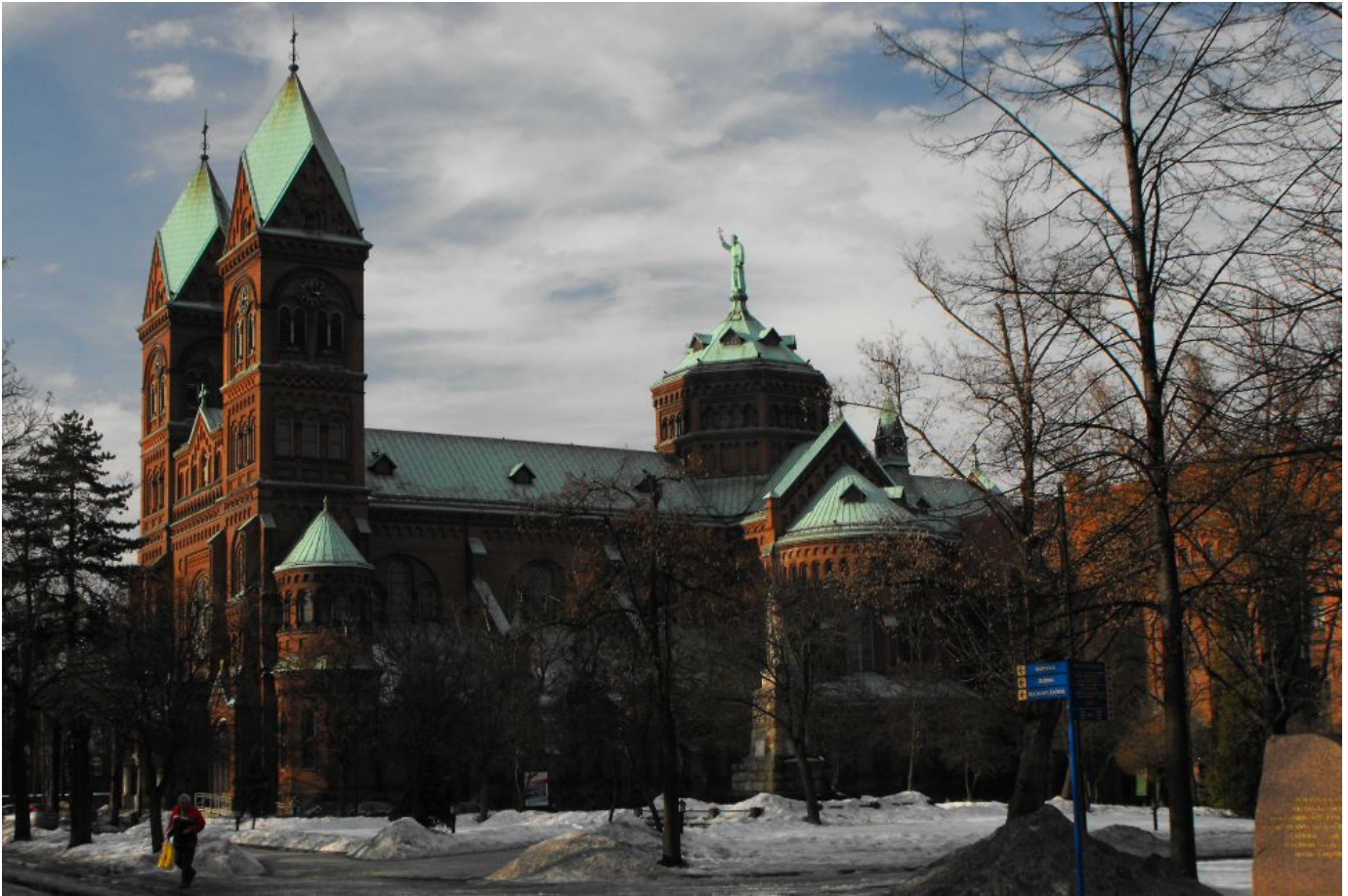
Franciscan monastery in Katowice Panewniki, Poland, 2010

The church's harshest opponents will go on fighting against it, whatever it does to assuage criticisms, while the church's most diehard supporters will go on defending it through thick and thin.