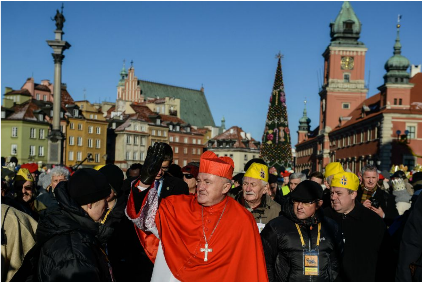
Cardinal Kazimierz Nycz of Warsaw, Poland, waves during the Three Kings parade in celebration of the feast of the Epiphany in Warsaw, Poland, Jan. 6, 2015.

faithful are no longer ashamed of their pastors, and pastors of their predecessors. Priests must see which skeletons lurk in their cupboards — and if they give the right signals, there's a great chance some deep purification will occur."