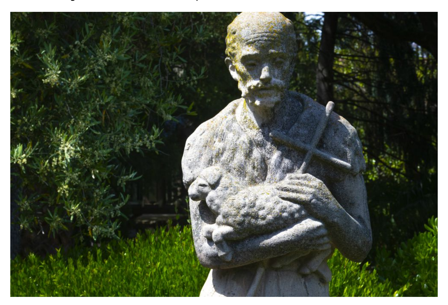
A religious statue is seen at St. Patrick's Seminary and University in Menlo Park, California, May 9.

"Our Catholic doctrine offers a rich teaching on the theology of creation and our role and meaning in the world," the bishops wrote in the introduction.