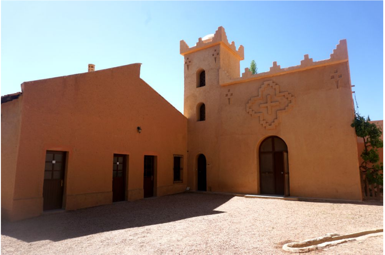
Notre Dame de l'Atlas monastery in Midelt, Morocco (W. M. Hughes) SLIDESHOW: CLICK THE ARROWS TO SEE MORE