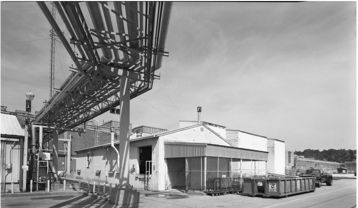
Fuel lines seen at the old Kansas City Plant in 2013

It was a double win for South Kansas City and Breslin. As a federally owned property, Bannister had remained tax exempt for nearly 70 years. Property tax assessors for Jackson County determined the federal complex had "no value" prior to transfer due to its aging structures and known environmental conditions. Once remediated, the leased industrial site could bring in $10 million a year, according to one research estimate.