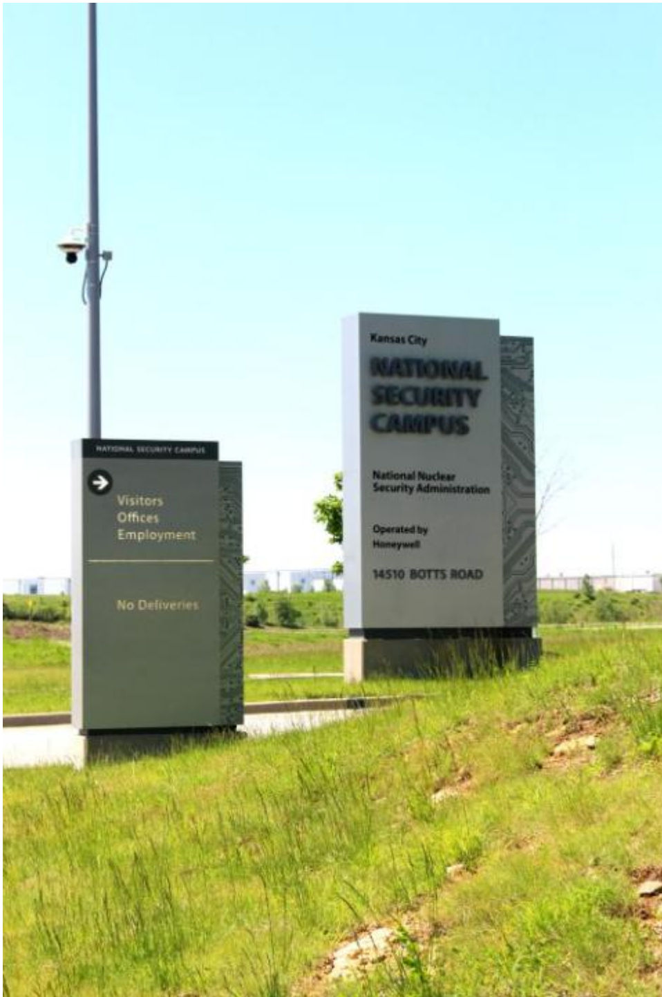
Entrance to Kansas City National Security Campus, 14520 Botts Rd., Kansas City, Missouri

Business is booming at the new Kansas City Plant, or Kansas City National Security Campus, as it is now called, on Botts Road in South Kansas City. The Trump administration's 2020 budget request for the operation is close to $1 billion — an