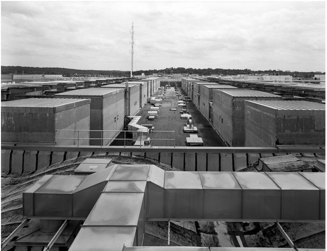
Roof view of Kansas City Plant's Main Manufacturing Building, 2013