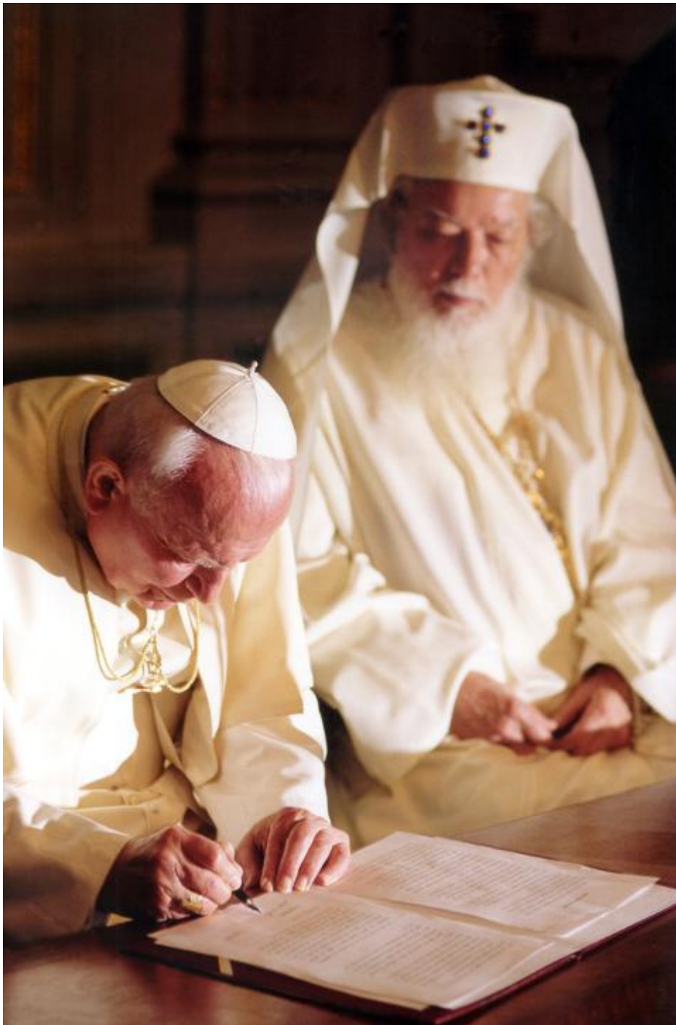
Pope John Paul II and Romanian Orthodox Patriarch Teoctist sign a joint appeal for brotherhood and coexistence in the Balkans, in Bucharest, Romania, in May 1999. The trip was a significant step toward improved relations between the Orthodox majority and the Catholic minority in Romania.