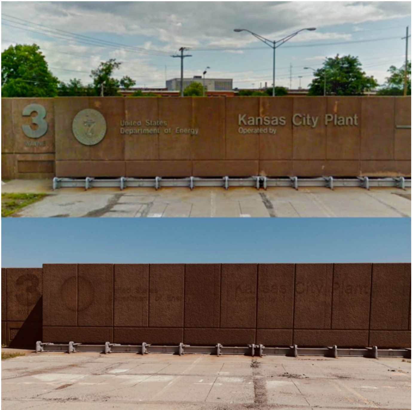
The Kansas City Plant gates before 2017, top, and today, May 2019