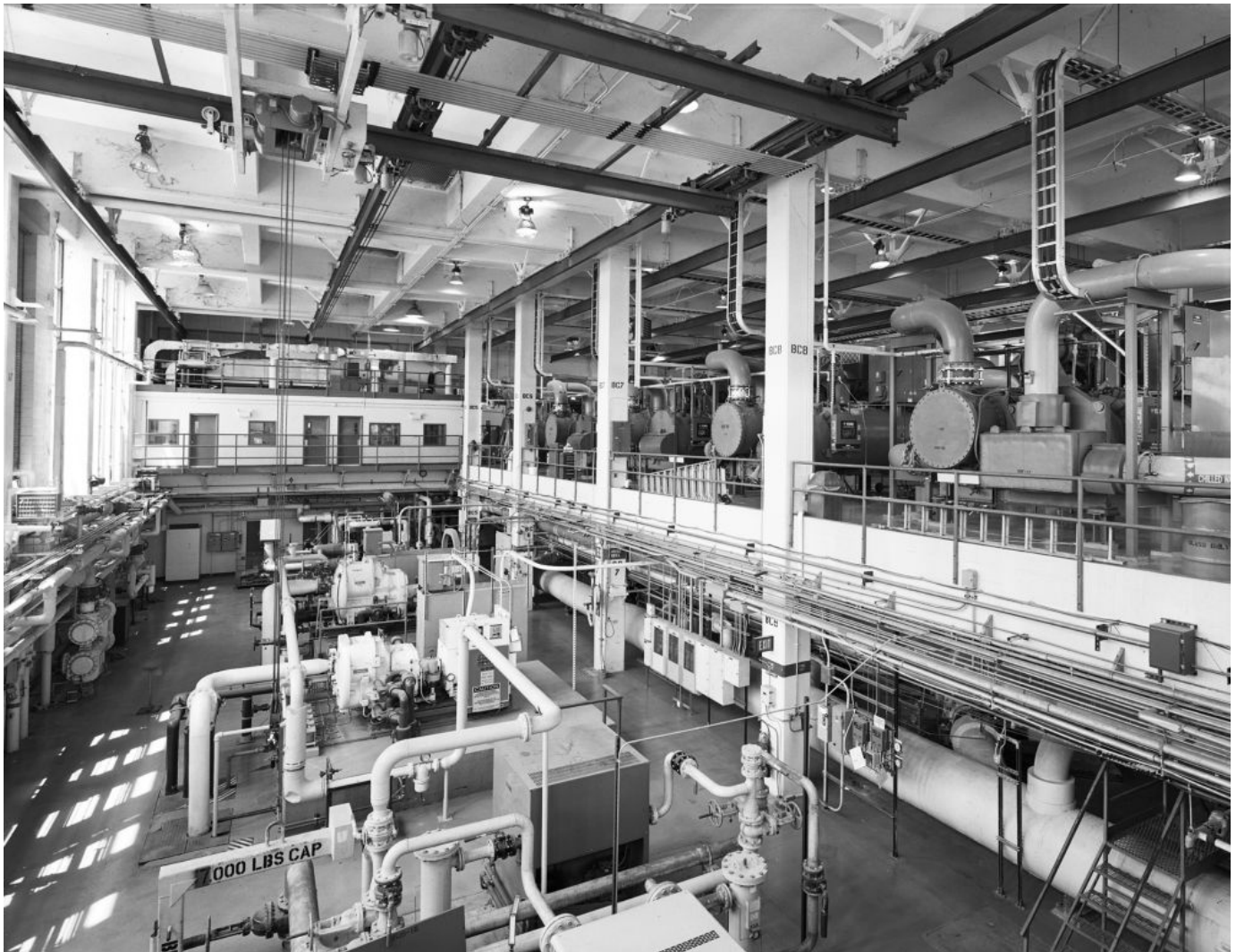
Kansas City Plant power house, 2013

National Catholic Reporter looks at the toxic legacy of one shuttered weapons plant in Kansas City, Missouri. In a three-part series about the Kansas City Plant on Bannister Road and its successor 8 miles south, NCR reviews hundreds of pages of government reports and environmental summaries, and interviews more than two dozen sources, including five plant workers and their families, three former federal employees who worked nearby, nuclear industry and government officials, health experts, business sources, state environmental regulators and a former city councilman.