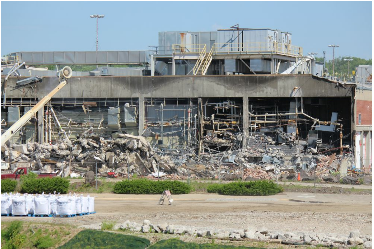
The Kansas City Plant, pictured May 16, 2019, is under demolition by a private developer.