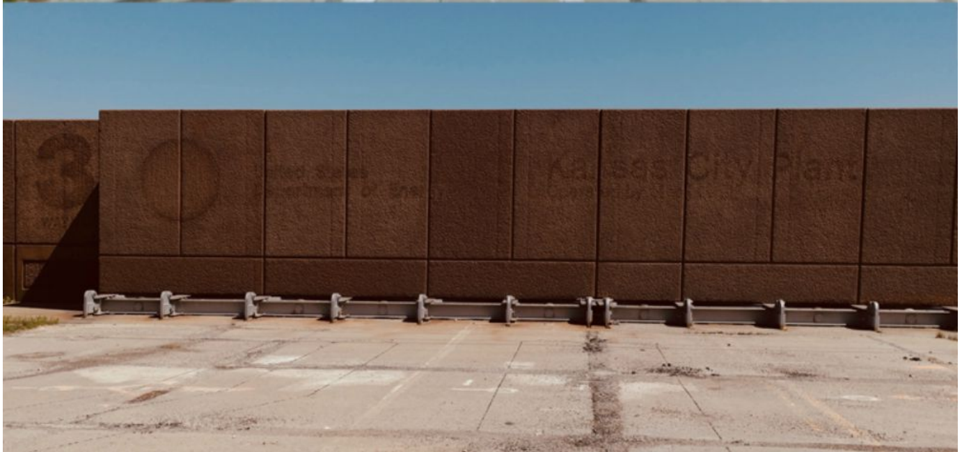
The Kansas City Plant gates before 2017, top, and today, May 2019

Public and legislative scrutiny of the program over the years resulted in an increase in the number of workers compensated. In 2008, the successful claims return