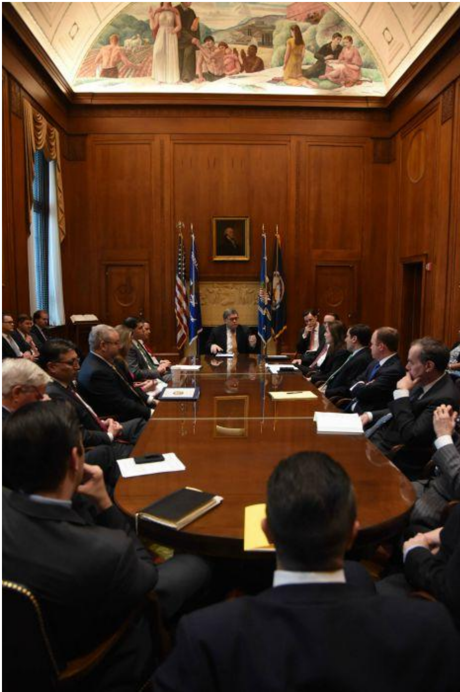
Attorney General William Barr meets with Justice Department leadership, Feb. 15.