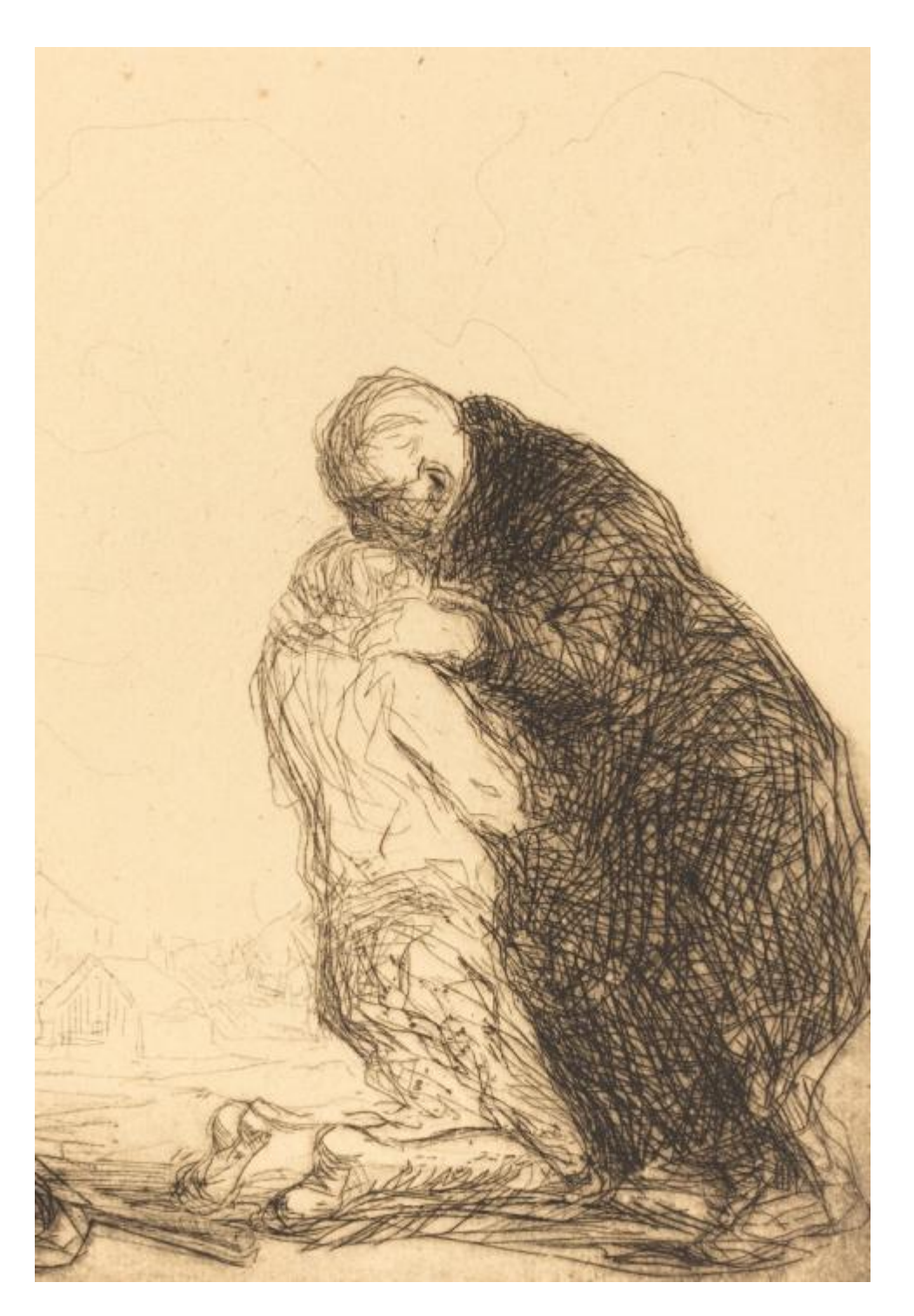
"The Return of the Prodigal Son" (1909) by Jean-Louis Forain (National Gallery of Art)

You may recall, if you were here <u>last week</u> at this Mass, that in our reflection about the Scriptures of last Sunday, I connected it with a passage from the book of the prophet Isaiah, talking about how extraordinary is the love of God for us. The passage speaks about a time when the chosen people had gone against God's will, had gone to war, even though the prophet had warned them. It was a disaster. They