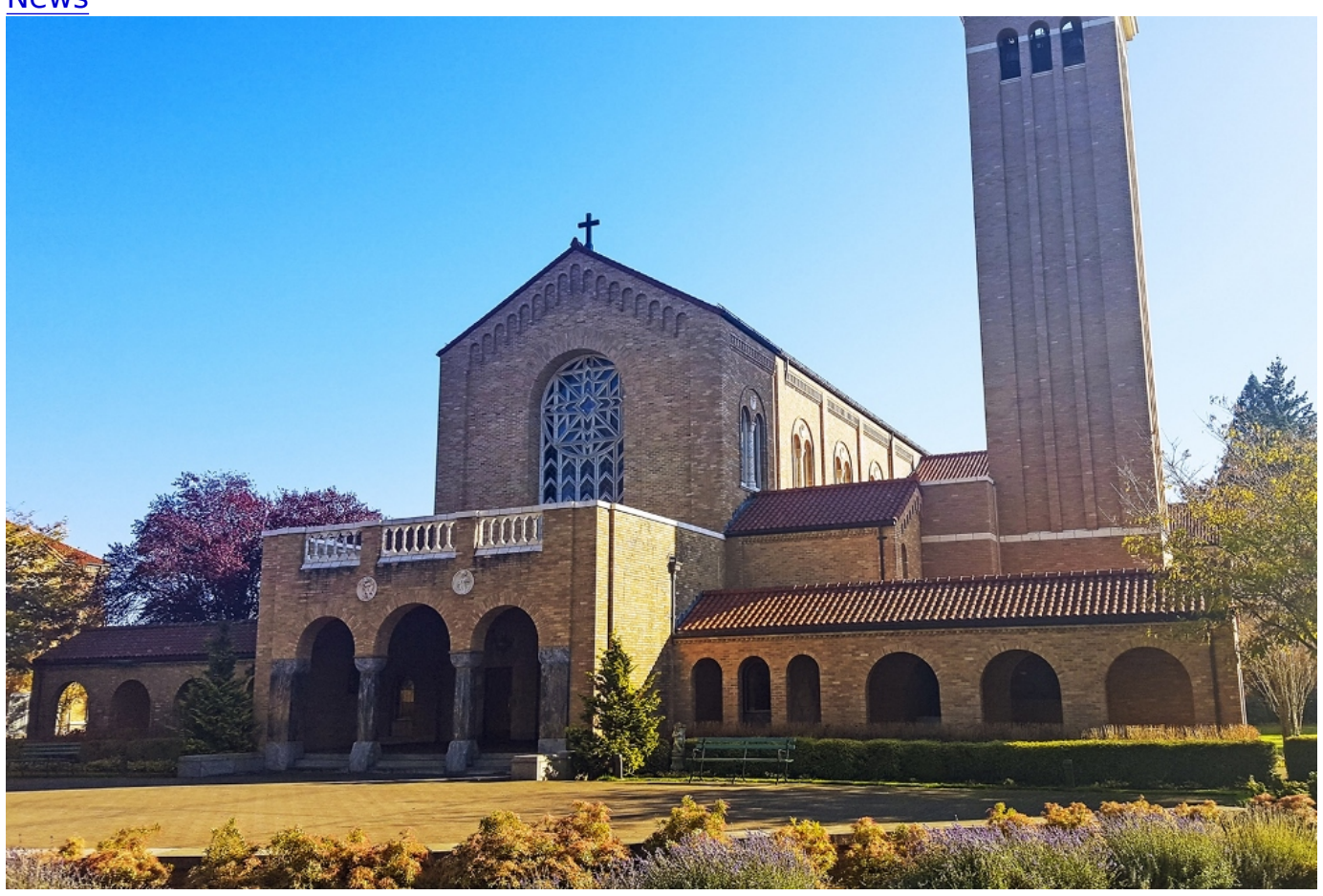
Mount Angel Abbey Church in St. Benedict, Oregon