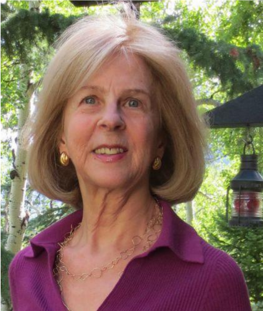
Elaine Pagels

Such beliefs usually had roots in sacred texts. For instance, she notes, "Creation stories help create the cultural world by transmitting traditional values." Which caused her to keep wondering, "Why do people continue to tell such stories to this day? What do these stories mean to them?"