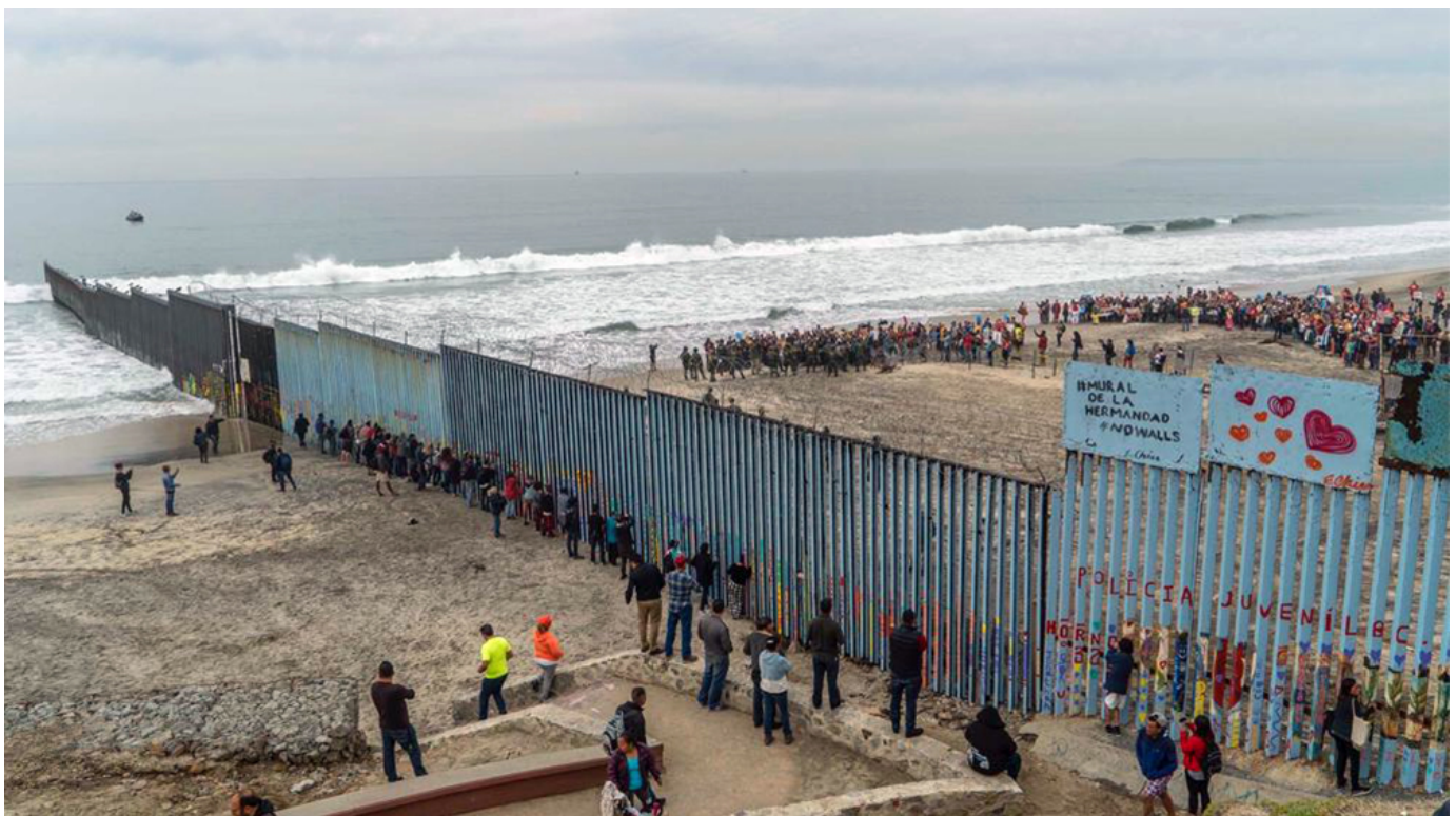
People protest against U.S. immigration policies on the American side, right, of the U.S.-Mexico border in Southern California on Dec. 10, 2018.

"I was there in the role that several of us played: as peacekeeper, to try to keep people moving, to try to keep things focused on why we were there," she said.