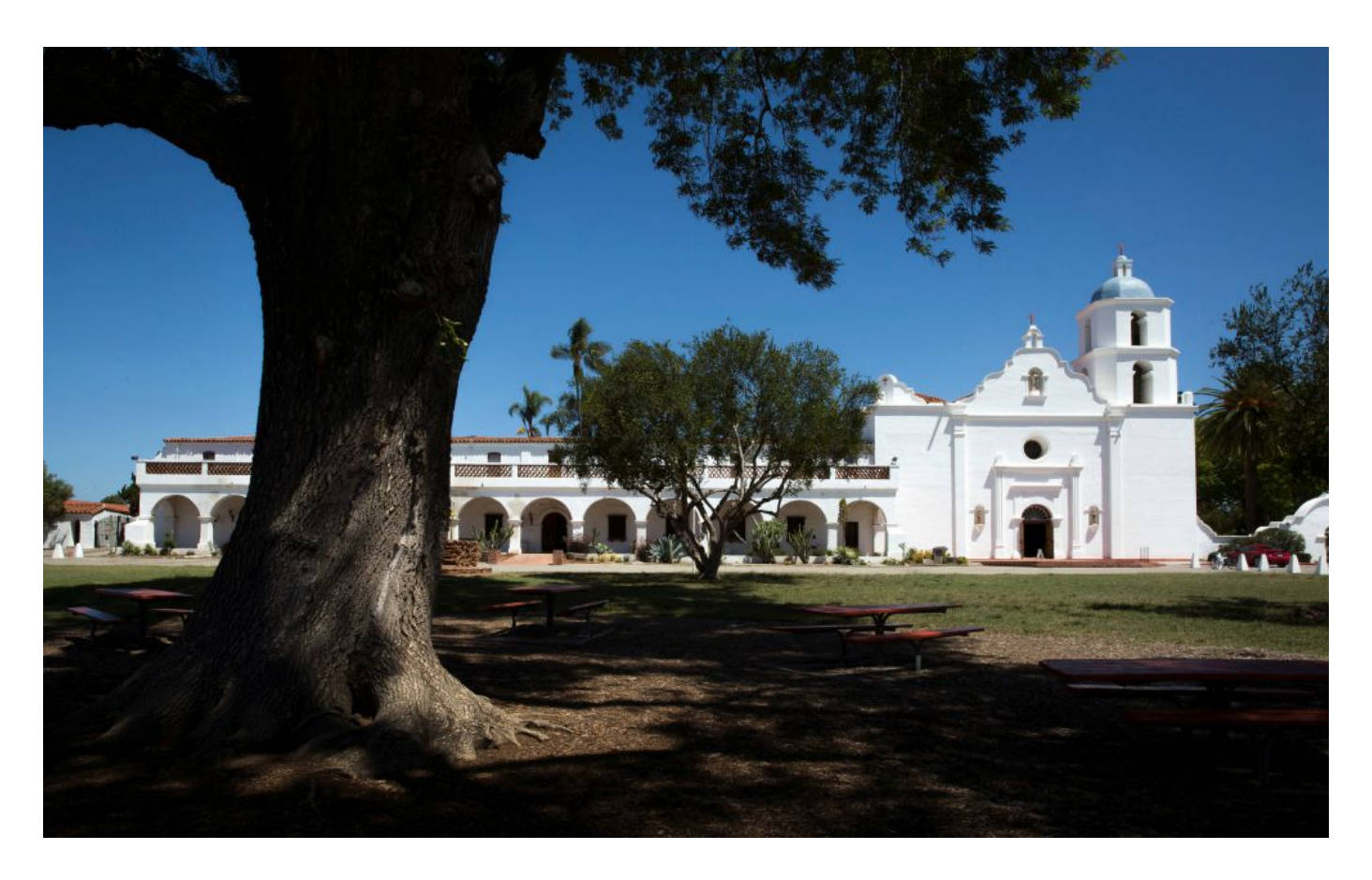
Old Mission San Luis Rey de Francia in Oceanside, California, July 26, 2015