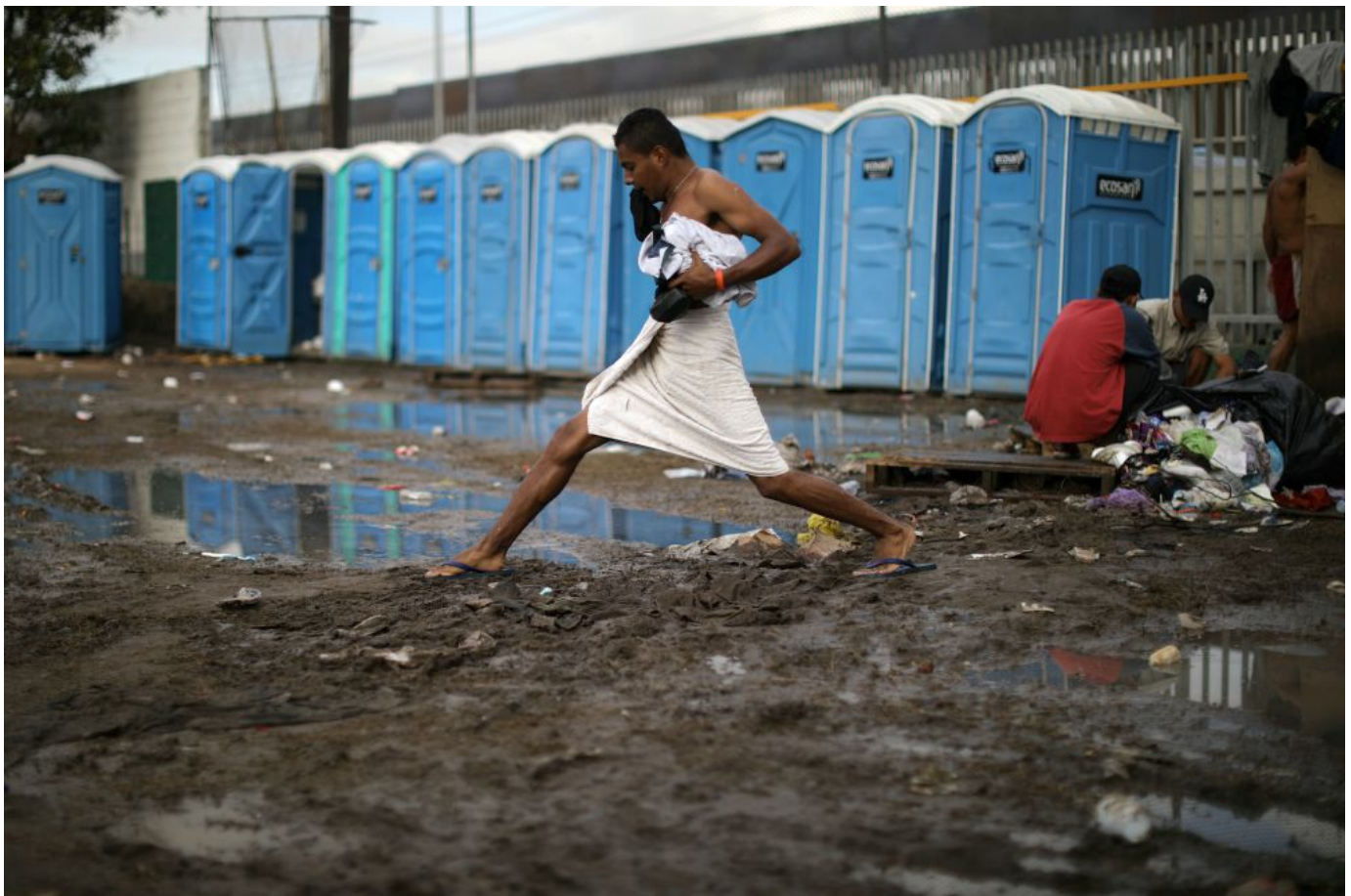
A migrant who is part of a caravan of thousands from Central America trying to reach the United States steps across mud after taking a shower Nov. 28 at a temporary camp in Tijuana, Mexico.

President Donald Trump has made it clear that he doesn't want caravan members to enter the U.S. in any way and has demanded that countries they pass through halt the group. Although this didn't stop thousands of migrants from reaching the U.S. border, many did turn back or decide to apply for asylum in Mexico instead of continuing to the U.S.