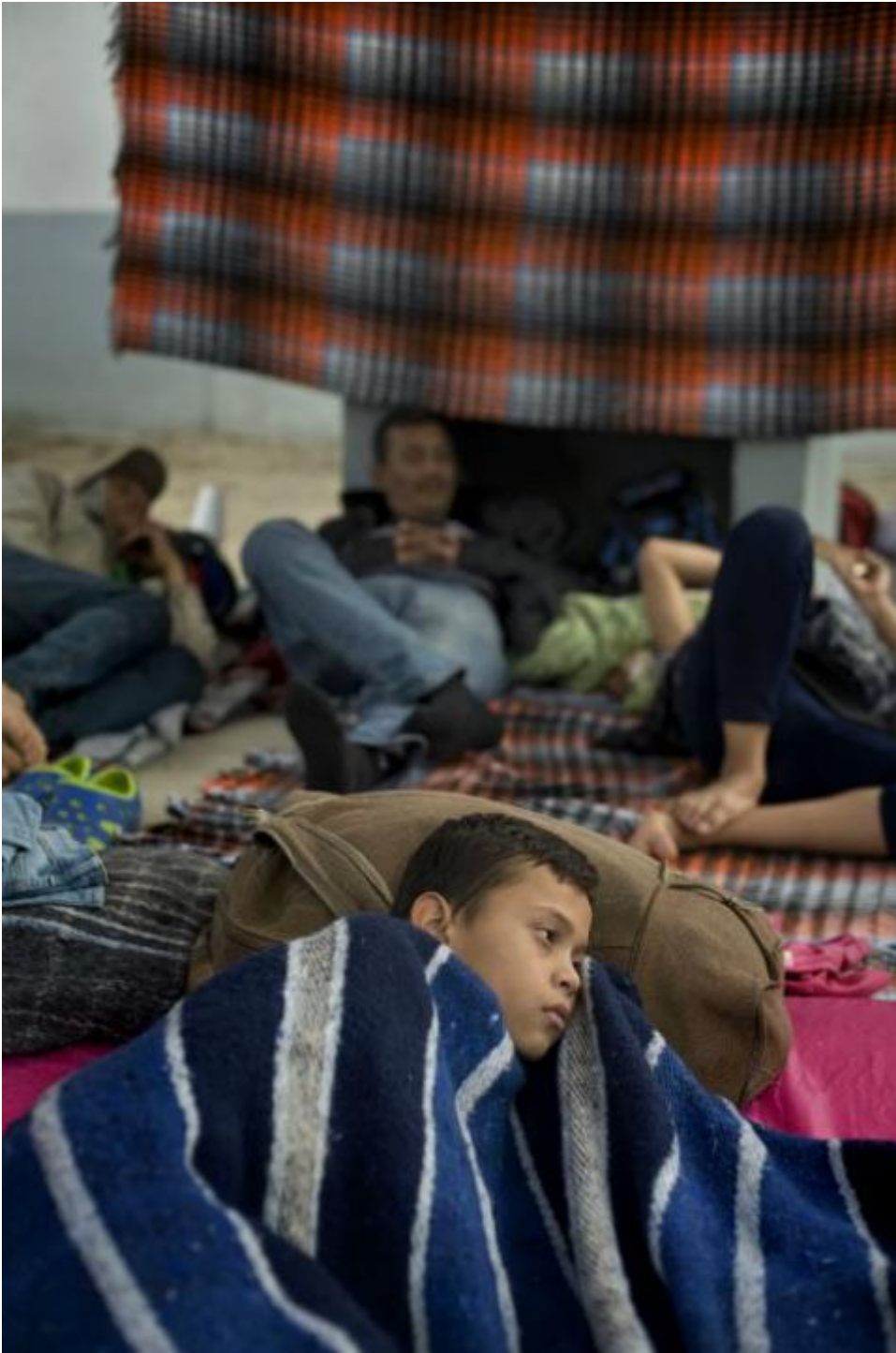
A boy rests at a shelter at a sports facility in Tijuana, Mexico, set up to for people arriving Nov. 15 in a caravan of Central American migrants at the U.S.-Mexico border. The shelter opened the previous night and had more than 750 people, but dozens more lined up outside waiting to enter.