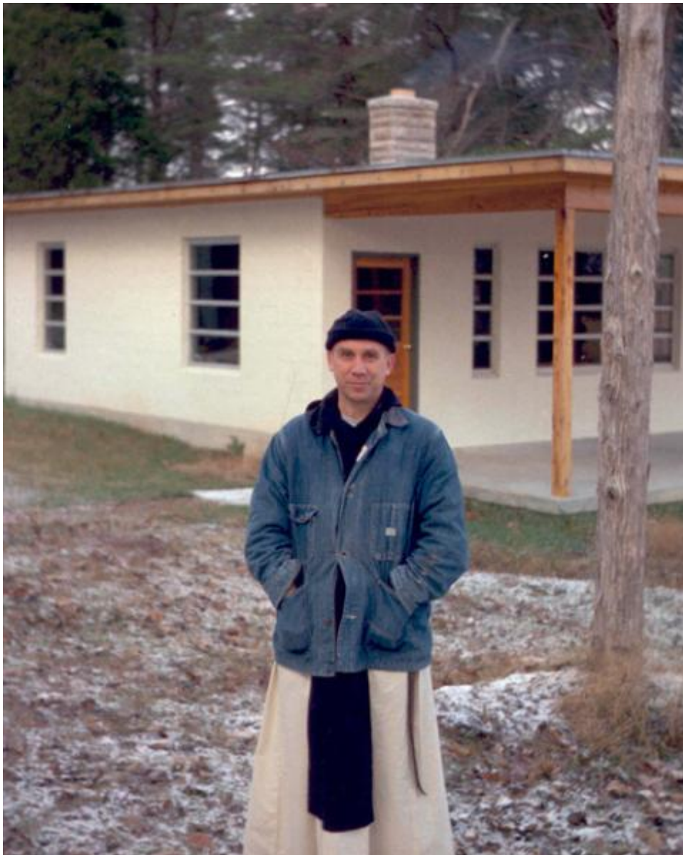
Trappist Fr. Thomas Merton, pictured in an undated photo

Third, there is what I believe is the most significant reason why people should care about Merton today: his unabashed humanity. Like his friend and contemporary, Dorothy Day, Merton is one of the few Christian exemplars we have who are not encumbered by hagiography and selective memory. A truly modern person, Merton's story is one with many turns, surprises, challenges and moments of grace. He had a life before the monastery and he had a life in the monastery: both periods lasted about 27 years. Both halves of his life reveal a complex man whose sanctity and sinfulness, pride and humility, ambition and regret are on wide display, thanks to his