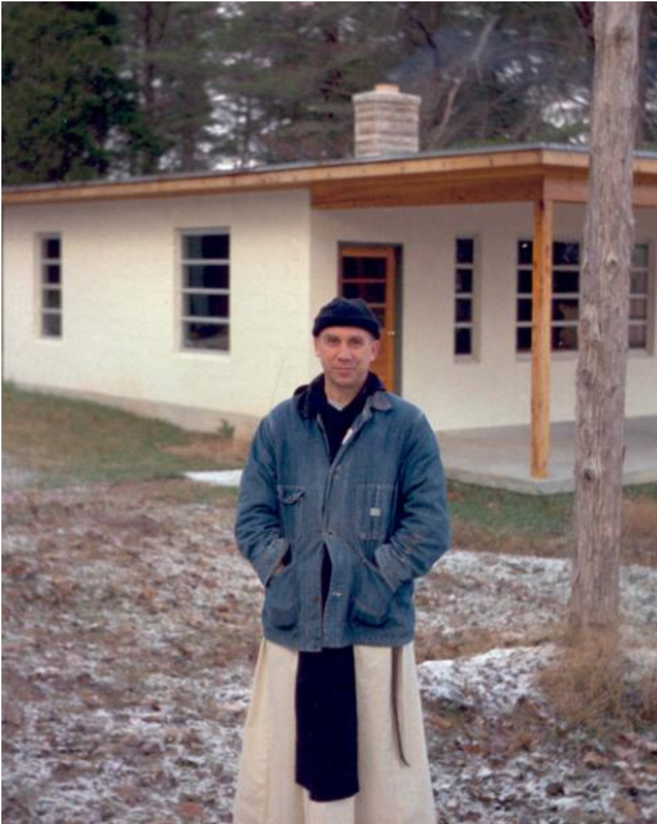
Trappist Fr. Thomas Merton, pictured in an undated photo

Third, there is what I believe is the most significant reason why people should care about Merton today: his unabashed humanity. Like his friend and contemporary, Dorothy Day, Merton is one of the few Christian exemplars we have who are not encumbered by hagiography and selective memory. A truly modern person, Merton's story is one with many turns, surprises, challenges and moments of grace. He had a life before the monastery and he had a life in the monastery: both periods lasted about 27 years. Both halves of his life reveal a complex man whose sanctity and sinfulness, pride and humility, ambition and regret are on wide display, thanks to his