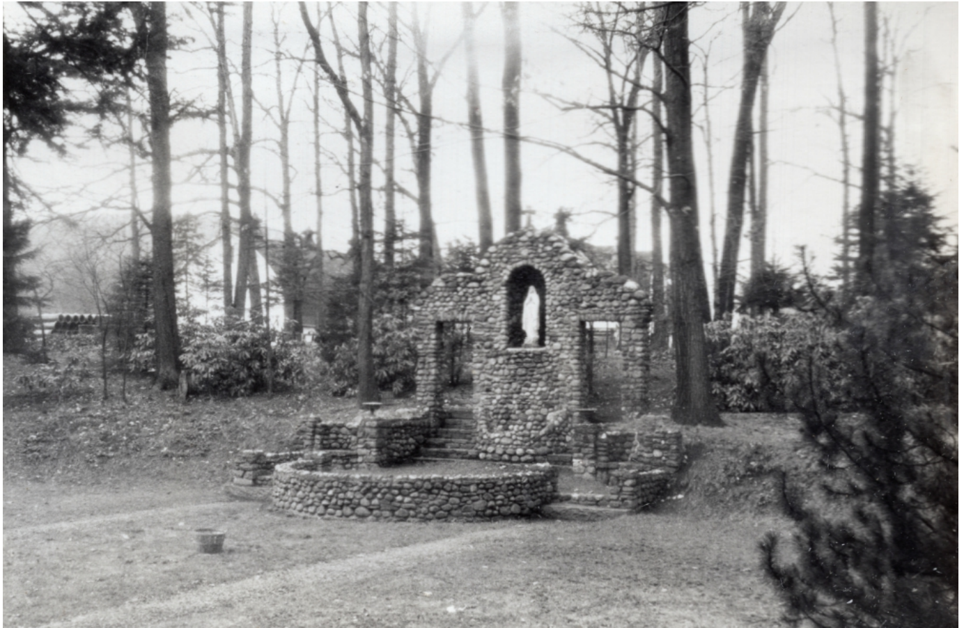
St. Bonaventure's Grotto of Our Lady of Lourdes, noted as a place for contemplation, was built by seminarians in 1925.