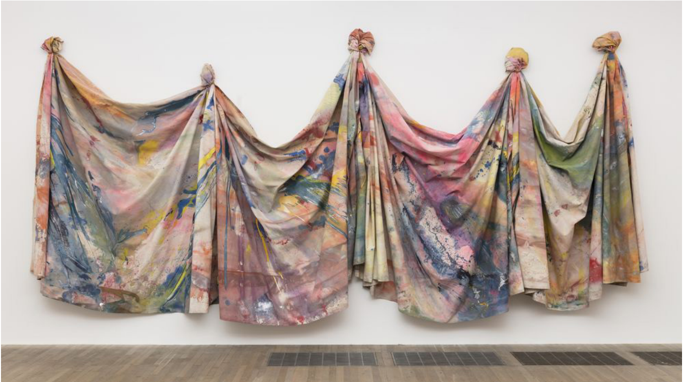
Sam Gilliam, "Carousel Change," by Sam Gilliam, 1970, from Tate Museum, courtesy of the artist and David Kordansky Gallery, Los Angeles, California; © Sam Gilliam

Bowling's expansive abstract landscapes in acrylic that faintly reveal stencils of continents formerly laid beneath them. And William T. Williams' homage to John Coltrane, "Trane" (1969), a terrific, slashing spectrum of diagonal bands of color intersecting and overlaying each other and loosely organized around an irregular rectangle angled at 45 degrees in the center of the painting.