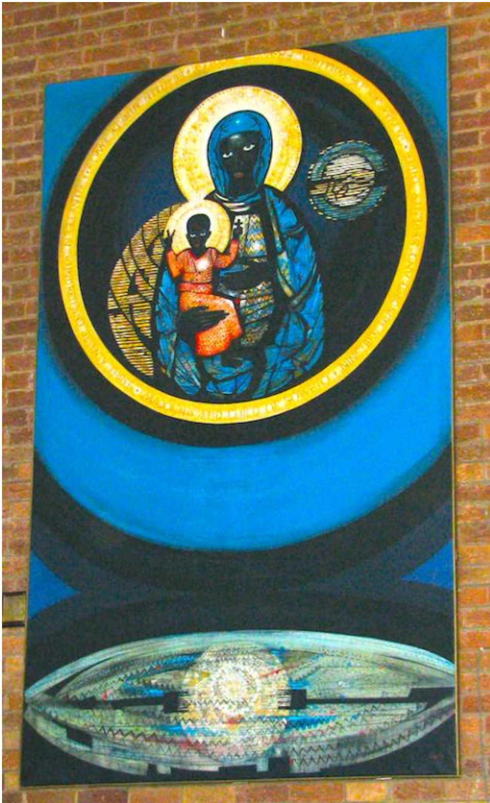
"The Madonna and Child of Soweto" at Regina Mundi Church in Johannesburg, South Africa