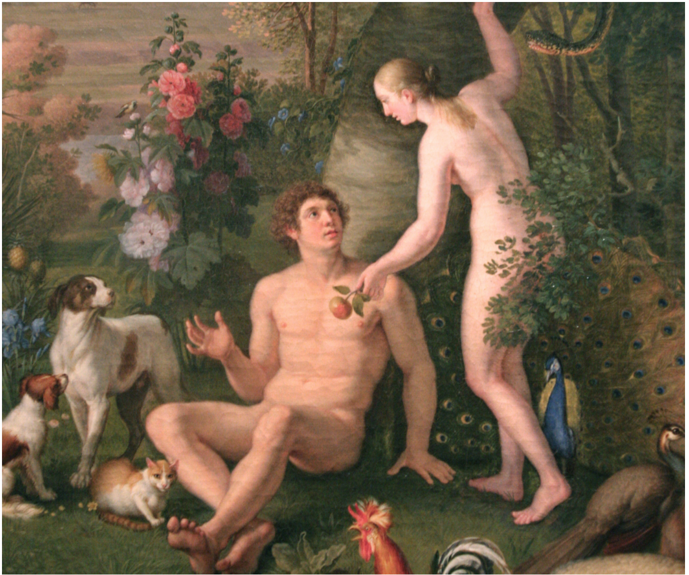
Detail of painting of Adam and Eve by Wenzel Peter, purchased by Pope Gregory XVI in 1831, displayed in the Pinacoteca at the Vatican Museums.

But the patrons and the artists also glorified Christ. One of the most wonderful inventions of Catholic artists, to me, is the biblical scene that unfolds with donors kneeling in prayer. There might be a Madonna and Child enthroned in the central position, while smaller depictions of the donors worship around the edges. These were the 1 percent paying good money to have themselves depicted within arm's-reach of Jesus, which is undeniably arrogant. But the move is also sweet and humble. These people were commissioning paintings of themselves subservient to a higher power. They didn't always live up to that standard, as fallen people living in a fallen world, but that doesn't mean the standard, given such brilliant aesthetic form