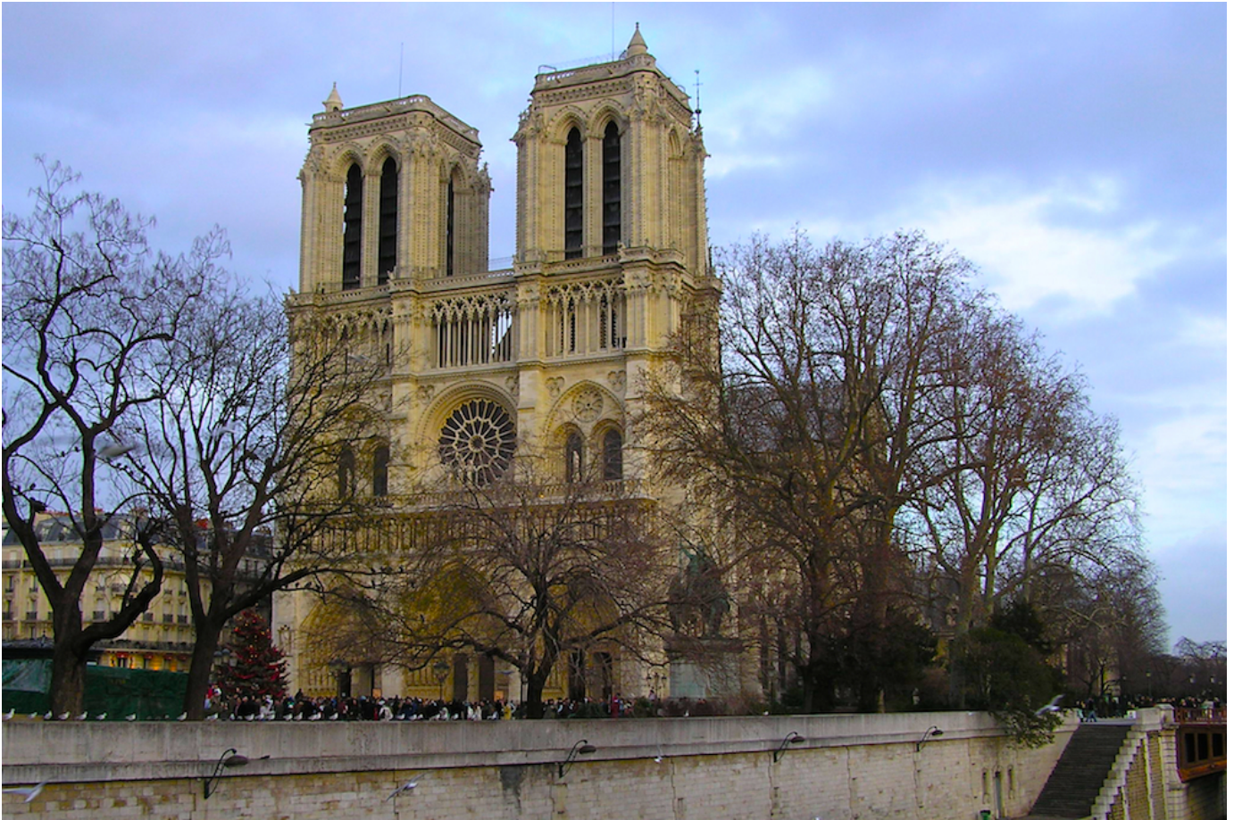
Notre-Dame Cathedral, built 1163-1250, Paris, France

I'm penning this article at a time that Jews throughout the world are still reeling from the shooting at a synagogue in Pittsburgh, where worshipers were killed for simply being Jews. That's been a recurring trope throughout Jewish history, and I'm aware that Christians, often in the name of their faith, have killed far too many Jews to count. That includes Hitler, although of course his views on religion weren't straightforward by any means. The question that many people within the community in which I grew up often ask themselves is whether to parse certain Christians from their faith's real mission or whether there is something rotten at the core of Christianity that birthed the Crusades, Inquisition, countless pogroms and blood libels, and the Holocaust.