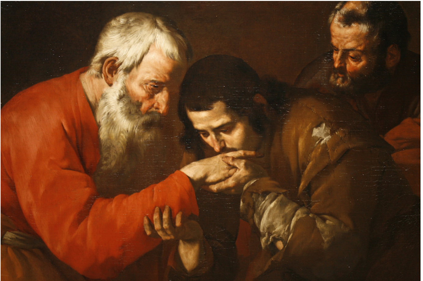
"The Return of the Prodigal Son," painting by an unknown artist, circa 1630 Italy, at the Museum of Biblical Art in New York.

immensely-important art to pay for the crimes of a demonic few. This also comes at a time that many, but not all, young people are less drawn to majestic, Gothic- or Renaissance-styled spaces, instead gravitating toward spaces, including sacred ones, which are more digitized and minimalist in design.