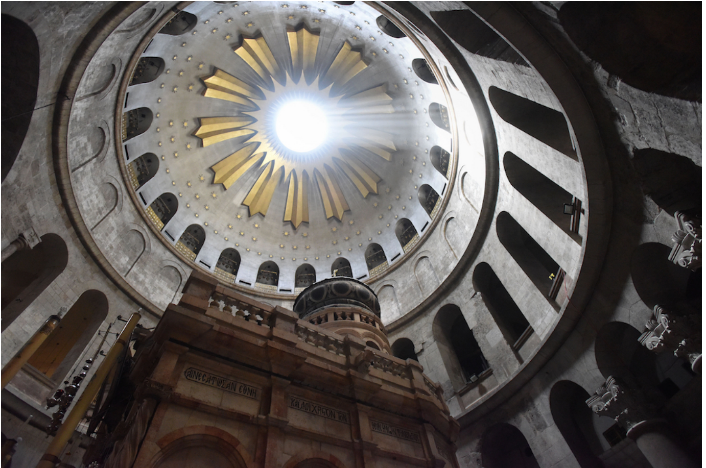
The Edicule, the traditional site of Jesus' burial and resurrection, at the Church of the Holy Sepulchre

Contemporary religious leaders, who have betrayed their flocks' trust and ruined so many lives with their disgusting abuses, may have stopped sometimes to marvel at the soaring ceilings of their cathedrals, or at the way a window bathed a pietà just so in otherworldly light. Seeing that beauty, and the divine traces reflected therein, didn't prevent them from committing their crimes. Asking art to do what only God can do — to make people wholly new and to give them a new heart — is futile. But even art funded by abominable patrons can inspire others to do and to be good. At a time when many are reportedly rethinking whether they see a place for themselves in the church at all, my sense as an outsider peering in is that art can suggest a path forward.