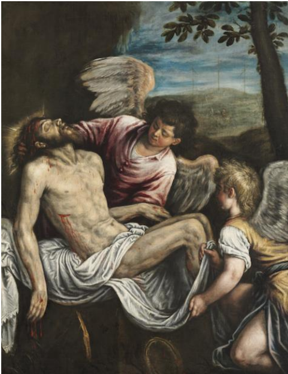
"The Dead Christ with Angels" by Leandro Bassano, circa 1580

I first started reporting on the intersection of religion and art because I was firmly convinced that art presents a less-divisive visual vocabulary with which to initiate conversations even about very controversial and painful topics. Once religious art has opened a door, I figured, the discussion can go in any number of other important and interesting directions. More than 15 years later, I'm still convinced that's the case, and I think Catholic art can be useful entry point for many Jews to think in new and different ways about the church. It also, I think, can help many Catholics think in