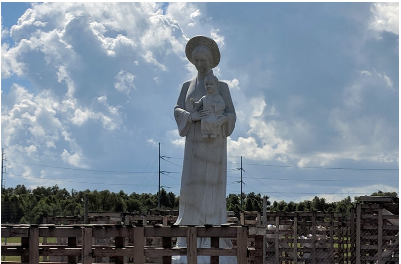
The statue of Our Lady of La Vang in New Orleans

The statue was carved from one piece of solid marble in Vietnam and then shipped to New Orleans this summer, he said, adding that the statue will be placed on an 11-foot foundation. A park will be developed around the statue in the coming year.