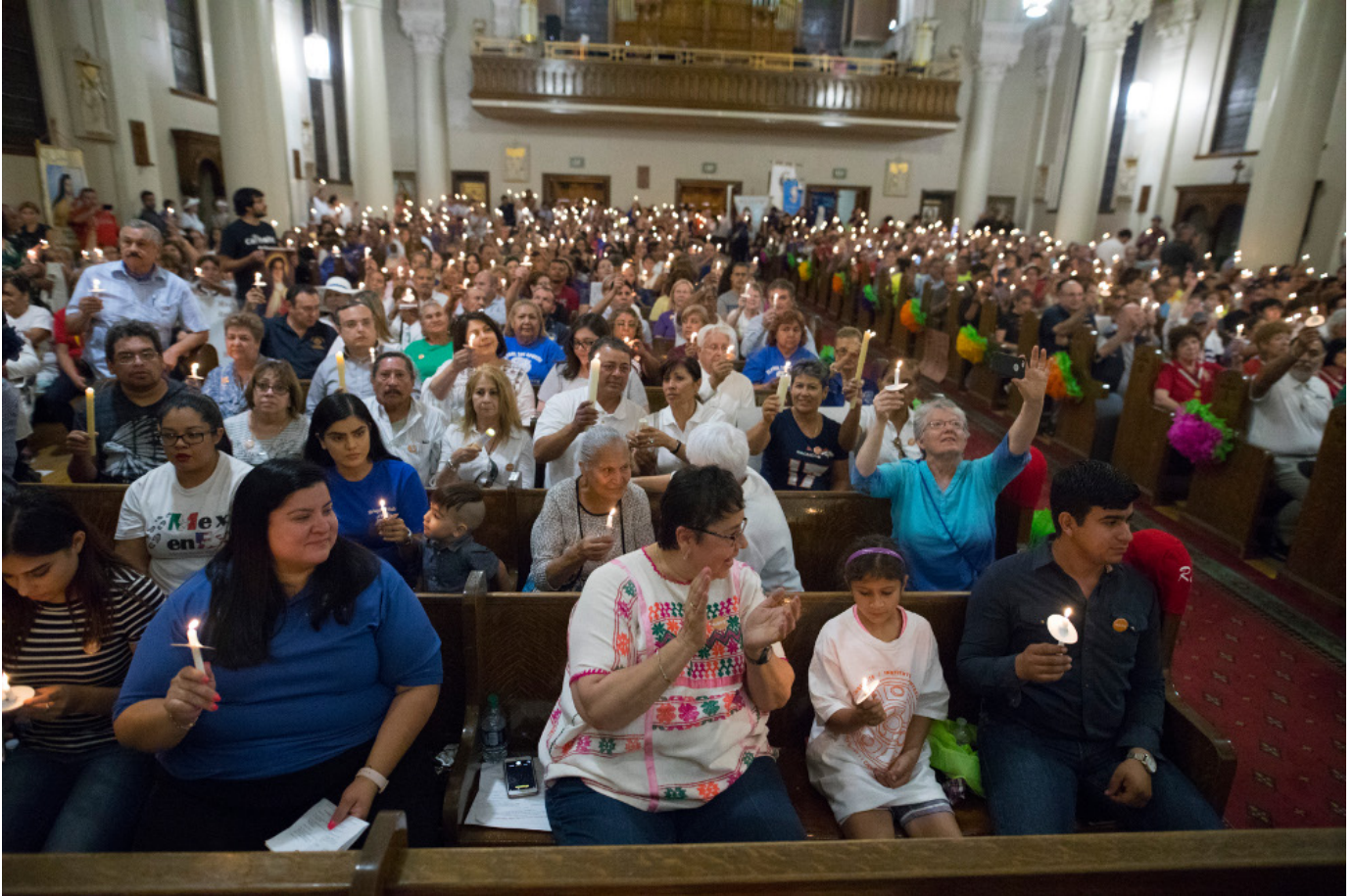
Worshippers attend a candlelight vigil July 20 at St. Patrick's Cathedral in El Paso, Texas, following an immigration march and rally.