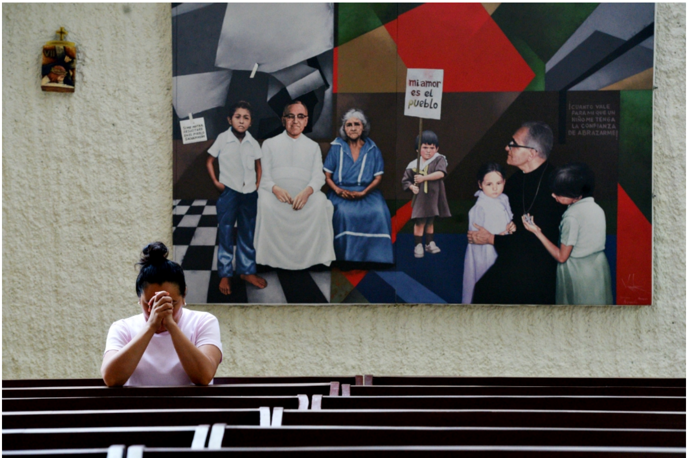
A woman prays in the chapel of Divine Providence Hospital in San Salvador May 21, 2015, two days before the beatification of Archbishop Óscar Romero, who was shot as he celebrated Mass in the hospital chapel March 24, 1980.

Romero was murdered Monday evening while celebrating Mass. "Standard textbook theology" had been deemed punishable by death.