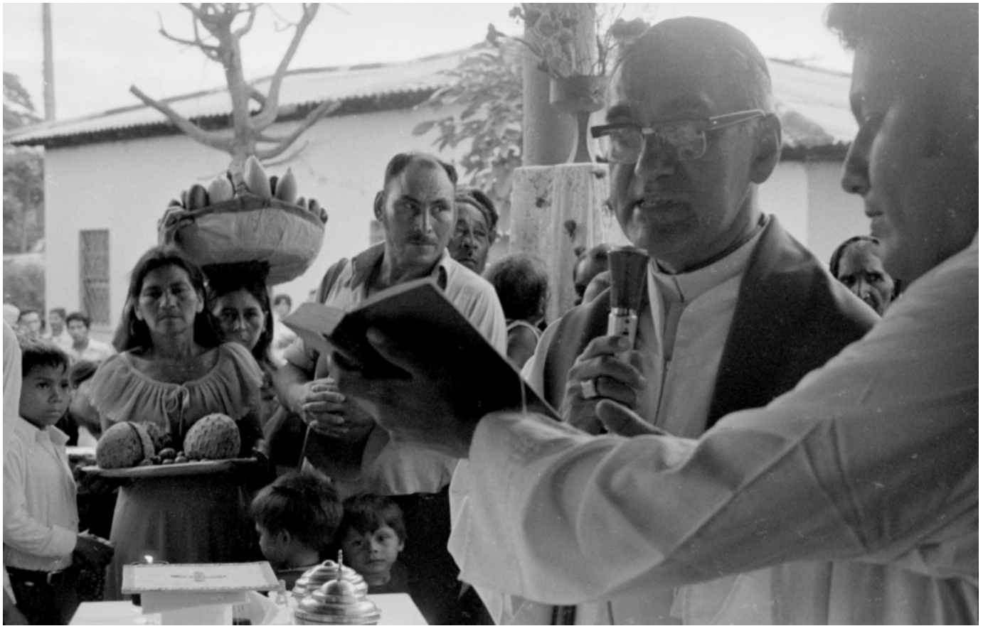
Archbishop Óscar Romero presides at a confirmation Mass in Ateos in San Salvador, El Salvador, September 1979.

Nor did Francis stop there; he did something else that had long cried out to be done. Many people aren't aware — but Francis was — of how shabbily Romero was treated by all but one of his brother bishops. Seldom has there been a condemnation of bishops as strong as the one Francis expressed to a group of Salvadoran pilgrims who were visiting the Vatican in 2015: