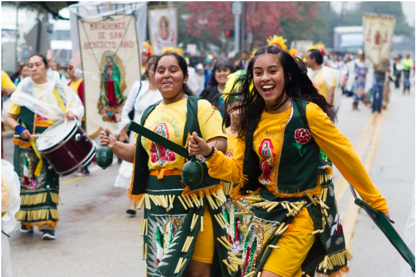
Two teenage girls perform with other Matachines dancers during a celebration honoring Our Lady of Guadalupe, Dec. 3, 2017, in Houston.

Taking seriously the trove of aesthetic materials, texts, paintings, music and what is generally understood as popular religion of these communities, she invites us to "overhear" the ways that being church is experienced in concrete lives and in tangible moments, lo cotidiano . The narratives that follow the invitation to "tell me everything" show that reason and the reasonable are not the enemy of imagination and the mysterious. In Latinx aesthetic materials, these coexist as multiple threads leading to religious insights.