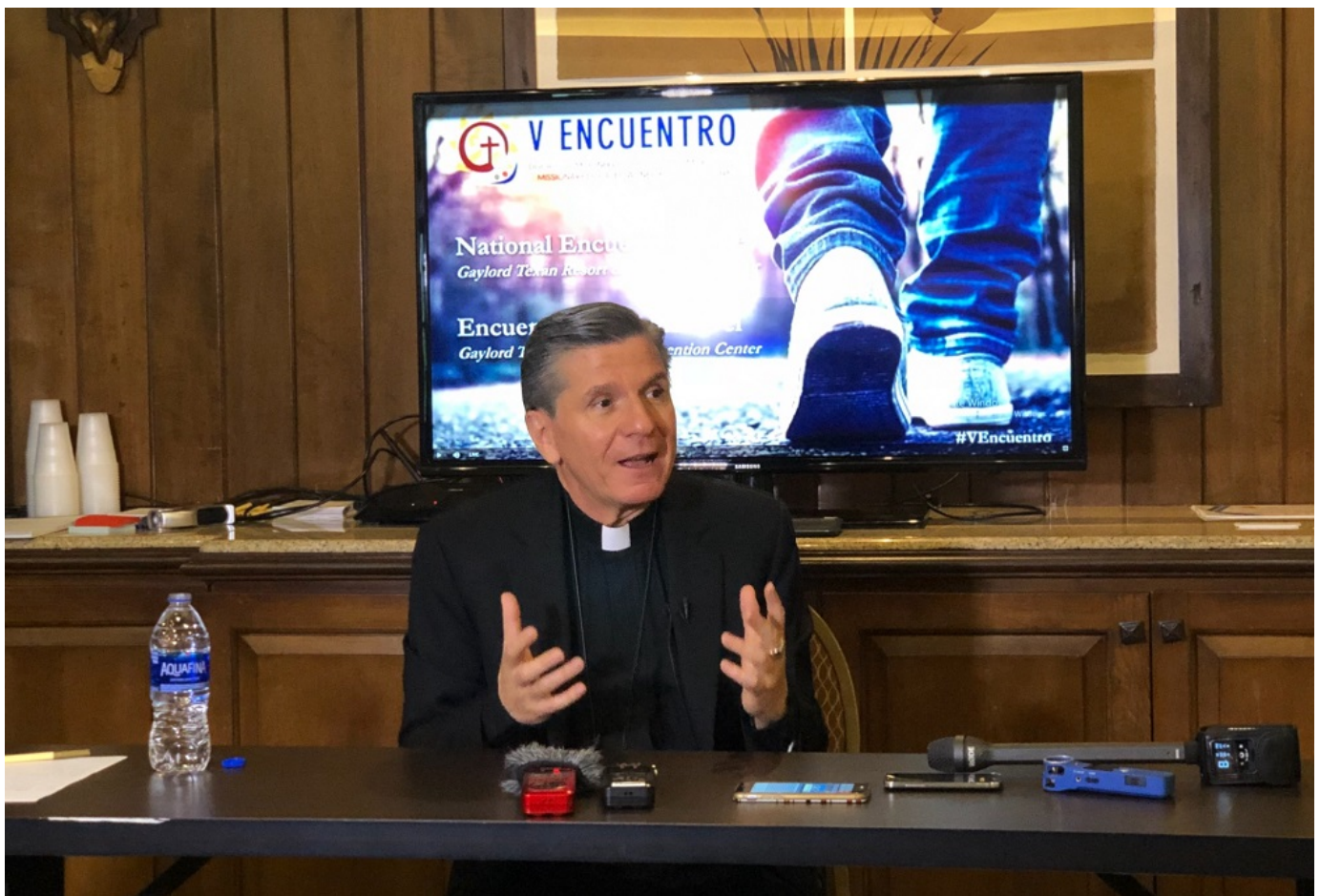
Archbishop Gustavo García-Siller speaks with the media Sept. 21 in Grapevine, Texas during the National V Encuentro.

García-Siller noted that the group of young people he dined with already disrupted the stereotypes he might have had.