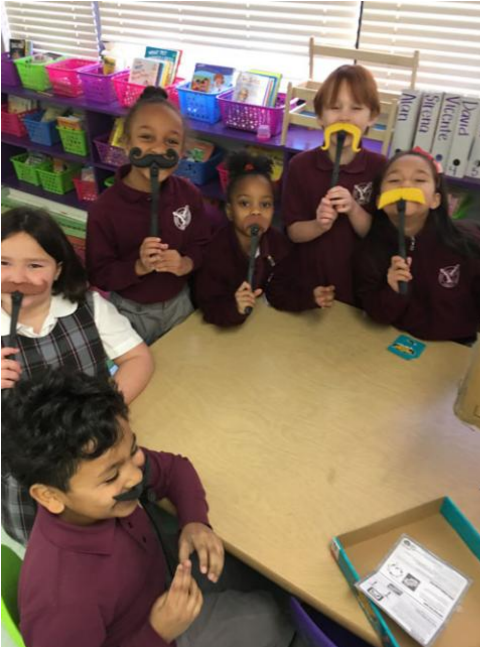
Students at Holy Family School in 2017

Another growth spurt followed the 1960 opening of NASA's Marshall Space Flight Center. Thousands of educated young families flocked to Huntsville, attracted by the region's abundant job opportunities. The Huntsville school system struggled to keep pace with this influx, opening 21 buildings over a 15-year span. Despite these new facilities, schools remained crowded. Some children attended split sessions while others occupied portable classrooms.