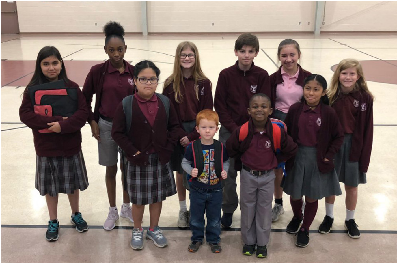
Group of students at Holy Family School in 2017