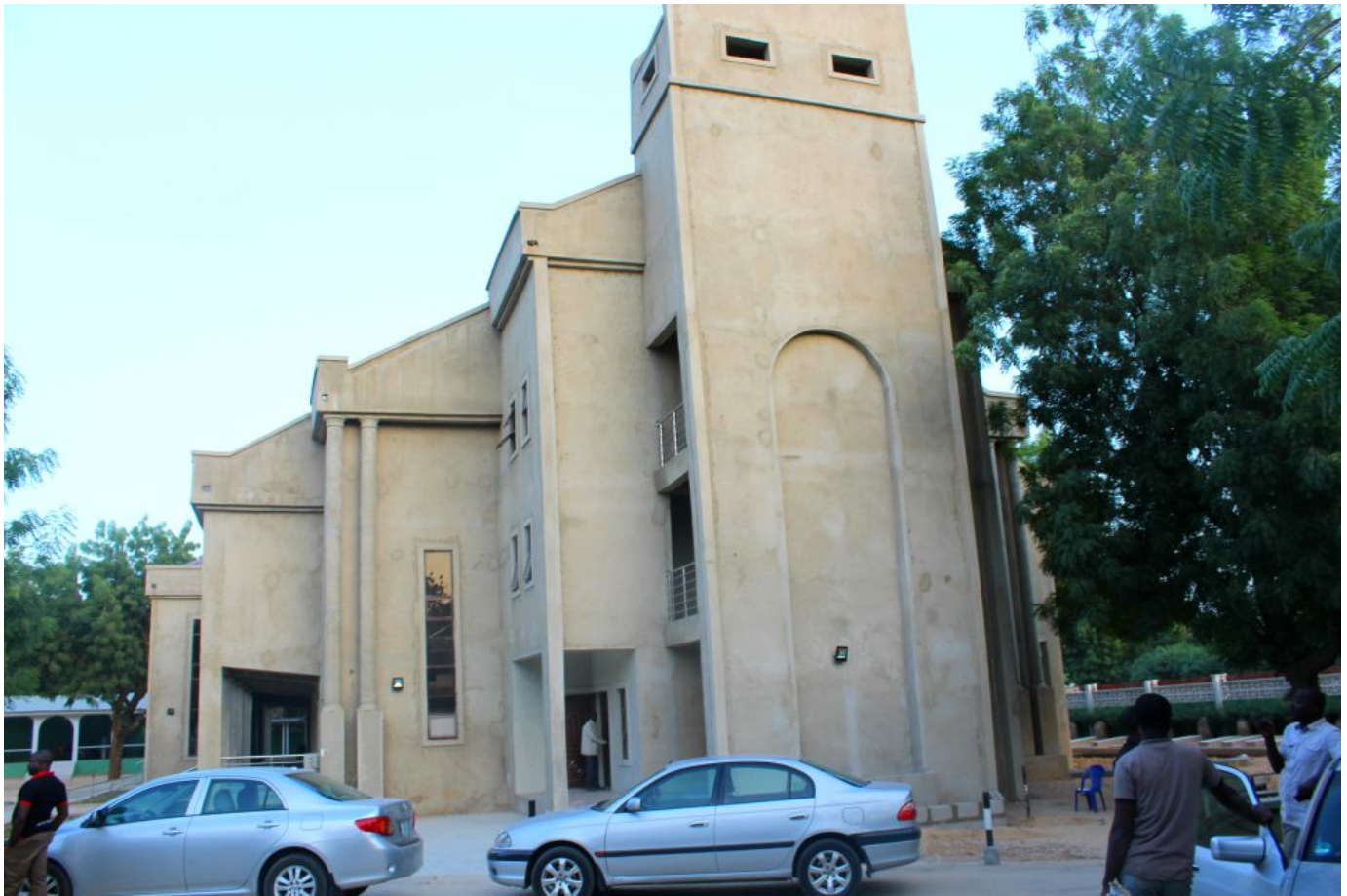
St. Patrick Cathedral in Maiduguri, completed and dedicated in 2017 (Festus Iyora)