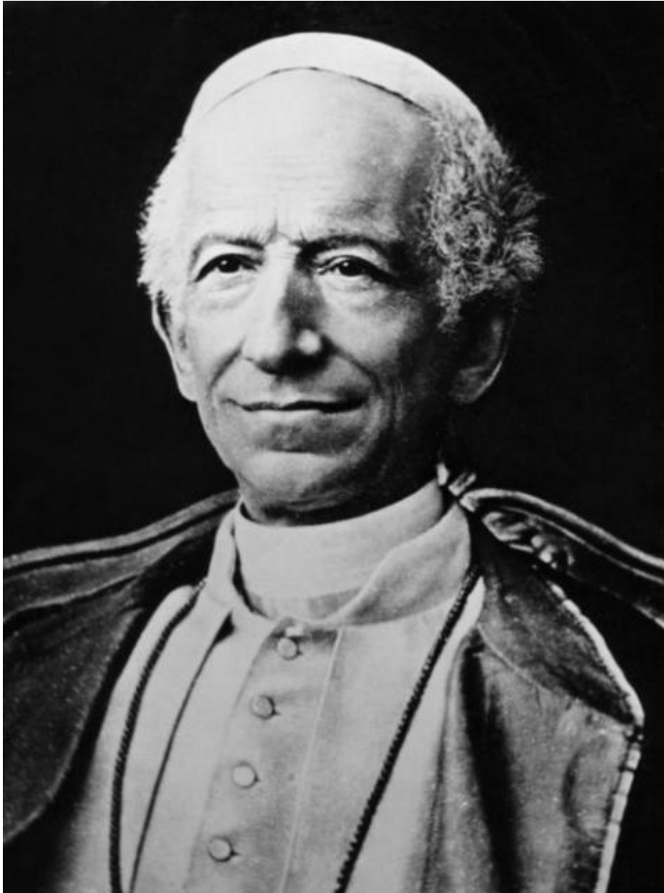
Pope Leo XIII, b. Italy March 2, 1810, pictured in an undated photo

Holiness to resign because, Viganò alleged, he had lifted sanctions against former Cardinal Theodore McCarrick that Pope Benedict XVI had allegedly enacted by demonstrably never applied.