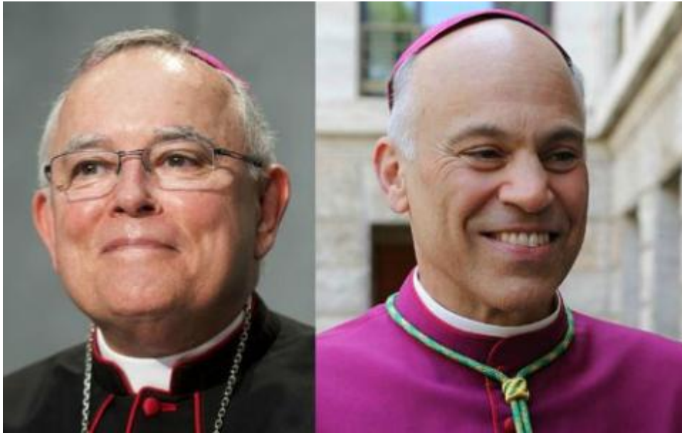
Archbishop Charles Chaput of Philadelphia, pictured 2014, left, and Archbishop Salvatore Cordileone of San Francisco, pictured 2013

recognition that they have lost the culture wars, and — most of all — the fear that the church they felt they owned has in fact been called by the Holy Spirit into new pathways and different directions, has not all this created an EWTN bubble in which it is acceptable for a bishop to affirm his loyalty to an ex-nuncio and not to the pope himself? Again, I refer you to the actual headline at the Register when the Viganò story broke: " Ex-Nuncio Accuses Pope Francis of Failing to Act on McCarrick's Abuse ." Except Pope Francis is the one who demonstrably acted against McCarrick. There will be no video of Francis, on the day of his retirement, greeting McCarrick with a warm smile as Benedict did.