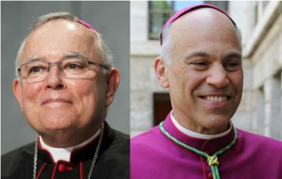
Archbishop Charles Chaput of Philadelphia, pictured 2014, left, and Archbishop Salvatore Cordileone of San Francisco, pictured 2013

recognition that they have lost the culture wars, and — most of all — the fear that the church they felt they owned has in fact been called by the Holy Spirit into new pathways and different directions, has not all this created an EWTN bubble in which it is acceptable for a bishop to affirm his loyalty to an ex-nuncio and not to the pope himself? Again, I refer you to the actual headline at the Register when the Viganò story broke: " Ex-Nuncio Accuses Pope Francis of Failing to Act on McCarrick's Abuse ." Except Pope Francis is the one who demonstrably acted against McCarrick. There will be no video of Francis, on the day of his retirement, greeting McCarrick with a warm smile as Benedict did.