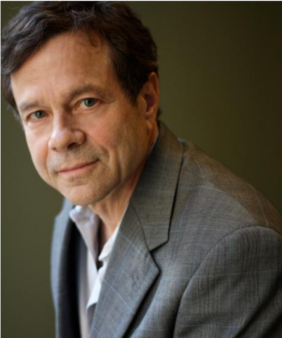
Alan Lightman

As a budding astrophysicist, he worked with Einstein's equations for gravity as well as other equations describing gas flow, radiation processes and thermodynamics. He learned among other things that Cygnus X-1 was located about 7,000 light years from Earth. Later, he applied those equations to other newly discovered black holes.