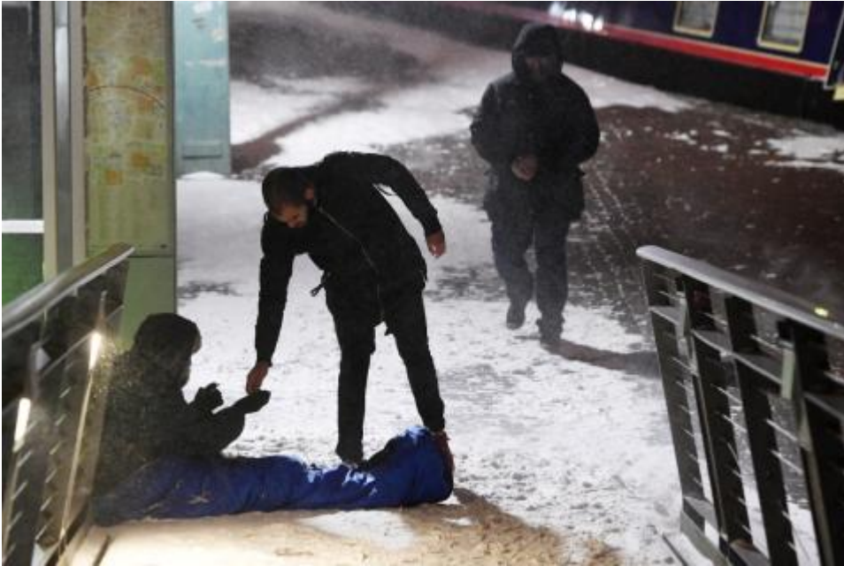
A man gives a homeless person money March 1 in Birmingham, England.

recently involves nongovernment organizations (NGOs). They have already had a significant effect in working for justice, peace, and the integrity of creation throughout the globe.