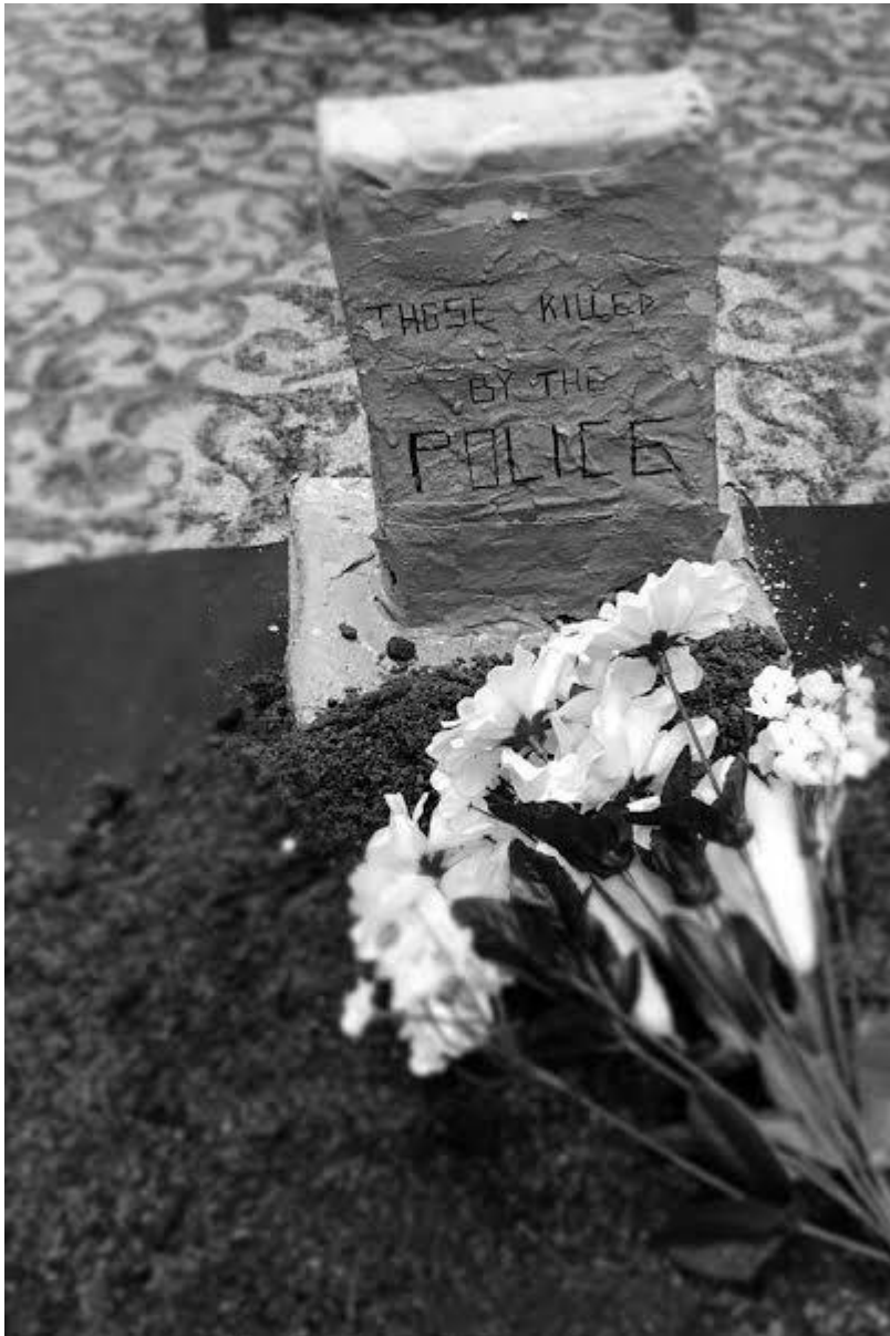
Detail a mock grave protesters created in the Minneapolis mayor's office

Faith in Action (formerly known as PICO National Network), DMV Sanctuary Congregation Network, Franciscan Action Network, National Domestic Workers Alliance, Moms Rising, We Belong Together, and several children representing those being detained also participated in a protest at the Russell Senate Office Building Rotunda June 21.