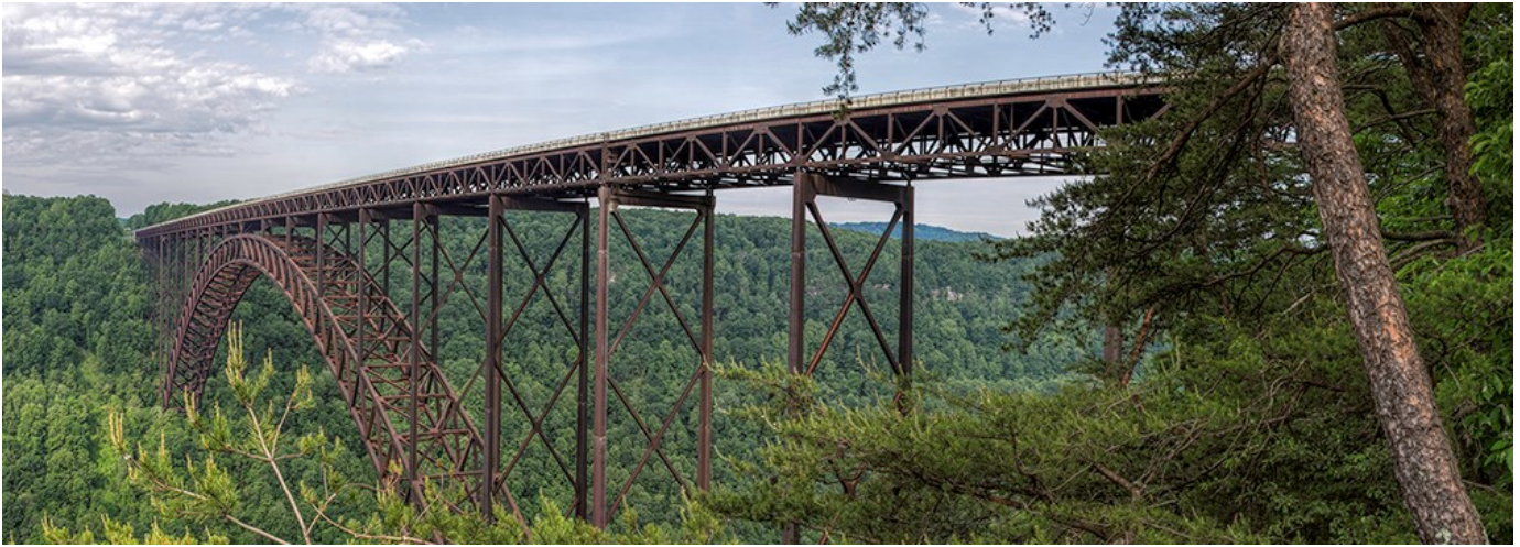
The New River Gorge Bridge in West Virginia

These books come at just the right time as Appalachia continues to play a role in national debates around race, poverty, labor, energy and diversity, and as new regional movements seem to be strengthening. Each gives deep historical context and summarizes the issues at stake for people on the ground working for justice, but finds its central purpose in helping to dismantle the harmful stories that still get in the way. Each is accessible and will find audiences far beyond insular Appalachian scholar and activist circles, while making contributions to scholarly debates, pushing beyond and even challenging some familiar tropes within the discourse.