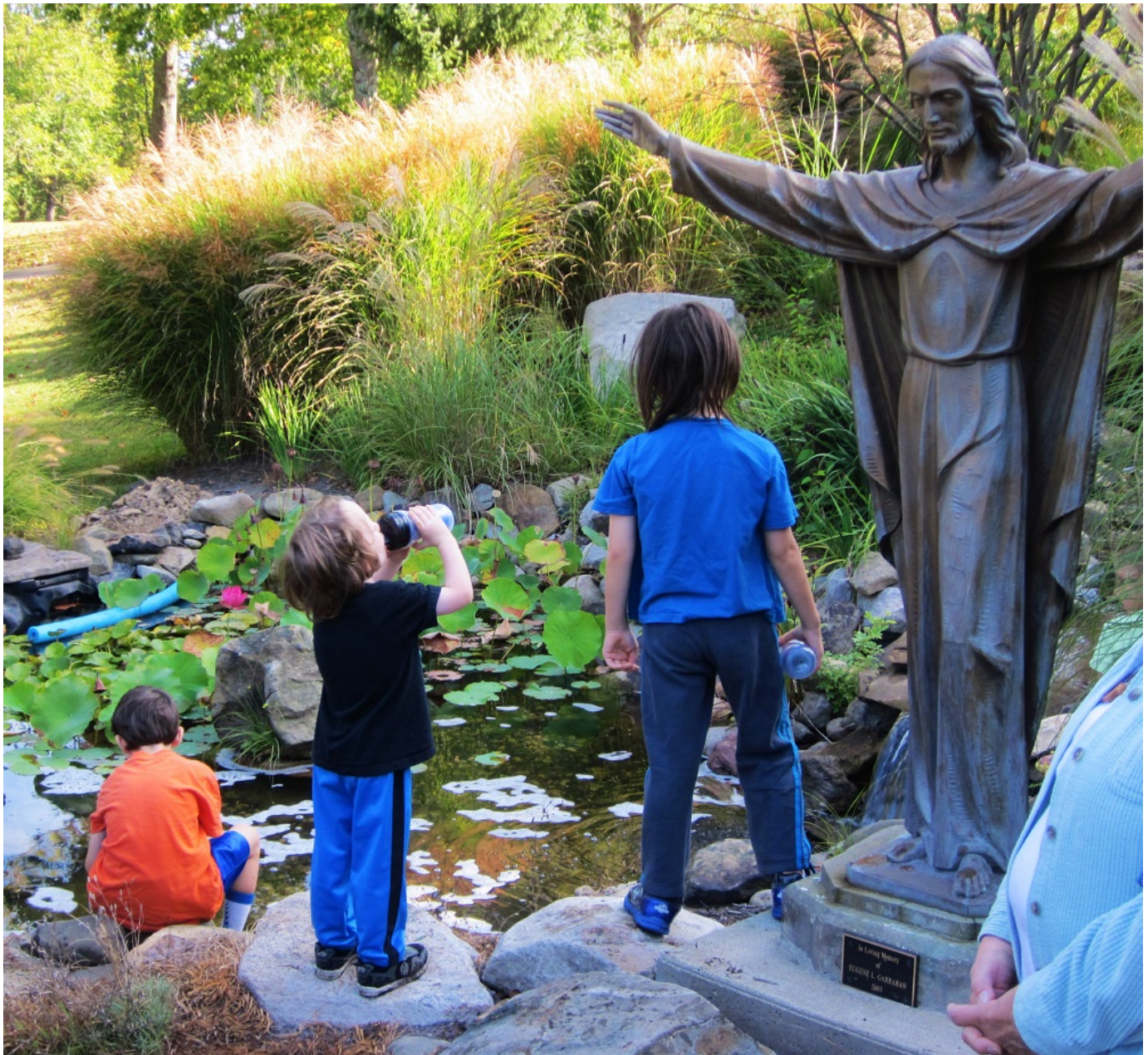
Children at the 2015 annual gathering of the Catholic Committee of Appalachia, held Sept. 18-20 in Charleston, West Virginia (Lydia Noyes)

Stoll argues that pre- and post-Revolutionary War European settlers in the Appalachian mountains were an example of an agrarian peasant culture, many of whom fled the poverty of countries like Great Britain where lords took control of land through enclosure, barring peasant access to the commons that provided the ecological base for a subsistence way of life.