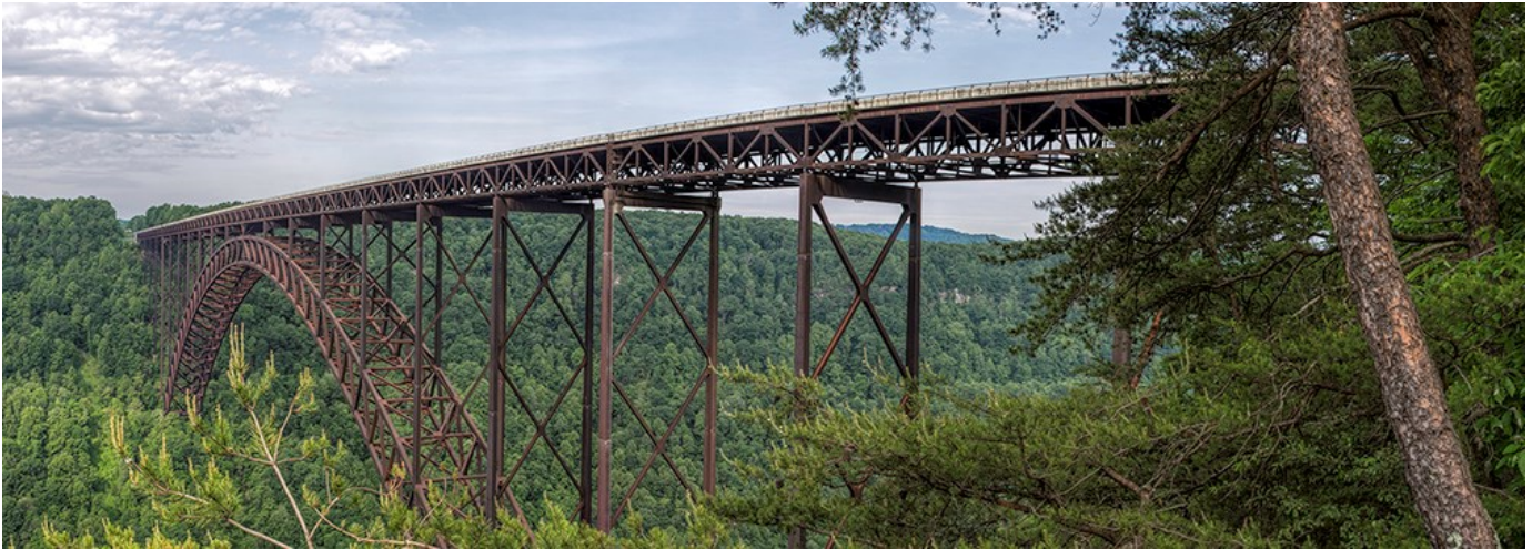
The New River Gorge Bridge in West Virginia

These books come at just the right time as Appalachia continues to play a role in national debates around race, poverty, labor, energy and diversity, and as new regional movements seem to be strengthening. Each gives deep historical context and summarizes the issues at stake for people on the ground working for justice, but finds its central purpose in helping to dismantle the harmful stories that still get in the way. Each is accessible and will find audiences far beyond insular Appalachian scholar and activist circles, while making contributions to scholarly debates, pushing beyond and even challenging some familiar tropes within the discourse.