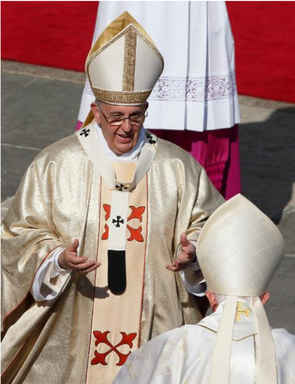
Pope Francis greets retired Pope Benedict XVI at the beatification Mass of Blessed Paul VI in St. Peter's Square at the Vatican Oct. 19, 2014.

taken up anew" and " 'the use of methods based on the laws of nature and the incidence of fertility' ( Humanae Vitae , 11) are to be promoted," it is " 'the parents themselves and no one else [who] should ultimately make this judgment in the sight of God' " ( Amoris Laetitia 222, quoting Gaudium et Spes , 50).