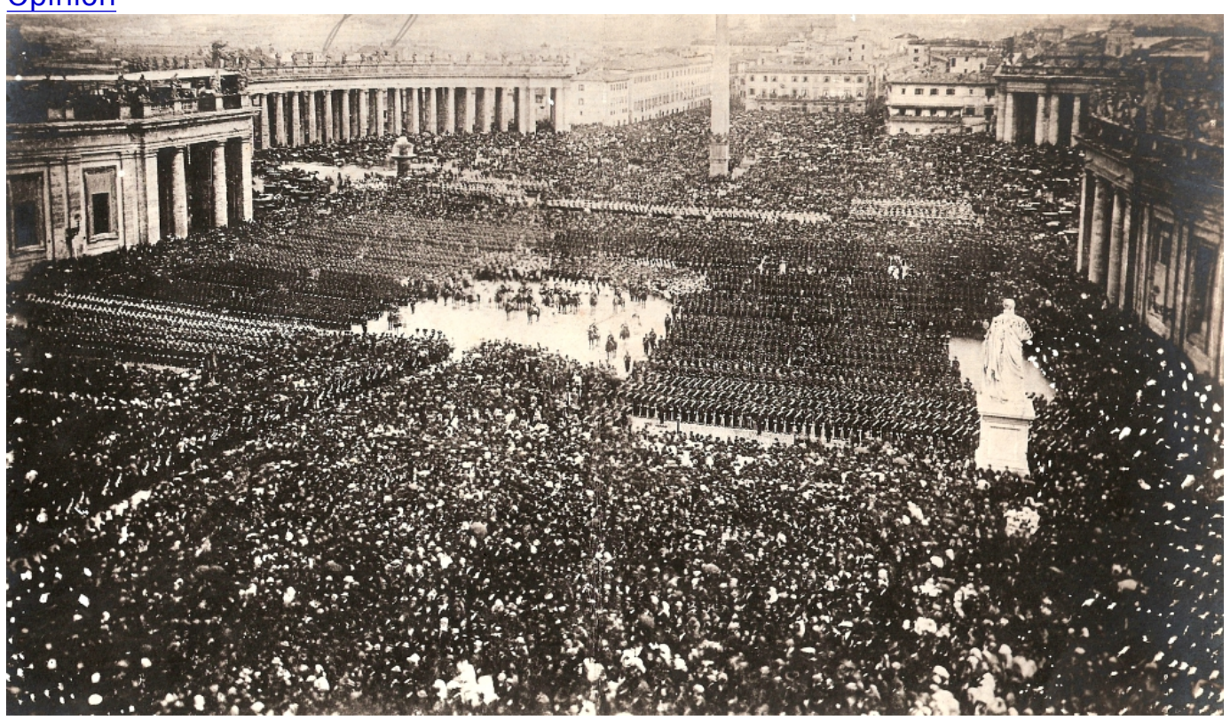
On April 25, 1870, Pope Pius IX blesses his troops for the last time before the defeat of the Papal States in the Capture of Rome later that year.