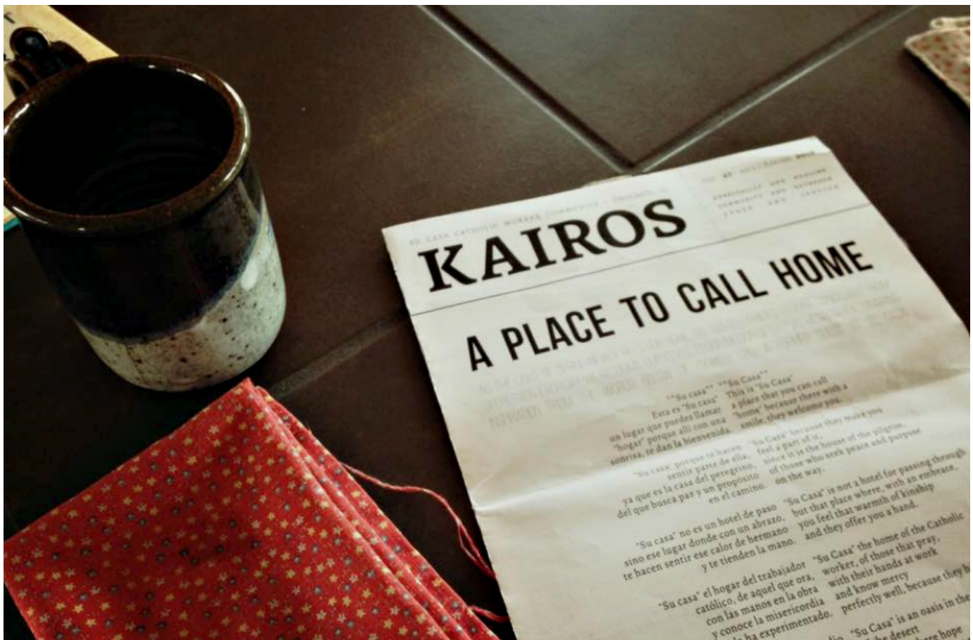
A copy of the Kairos newsletter for Su Casa Catholic Worker house in Chicago