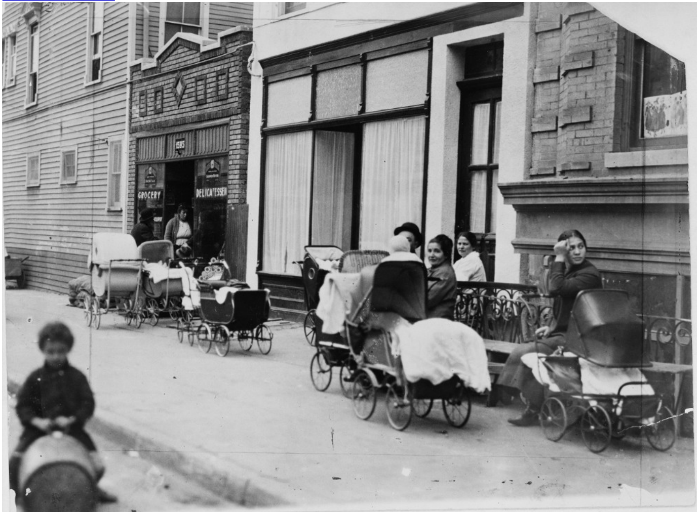
Women and men sit with baby carriages in front of the Sanger Clinic in New York City in October 1916.