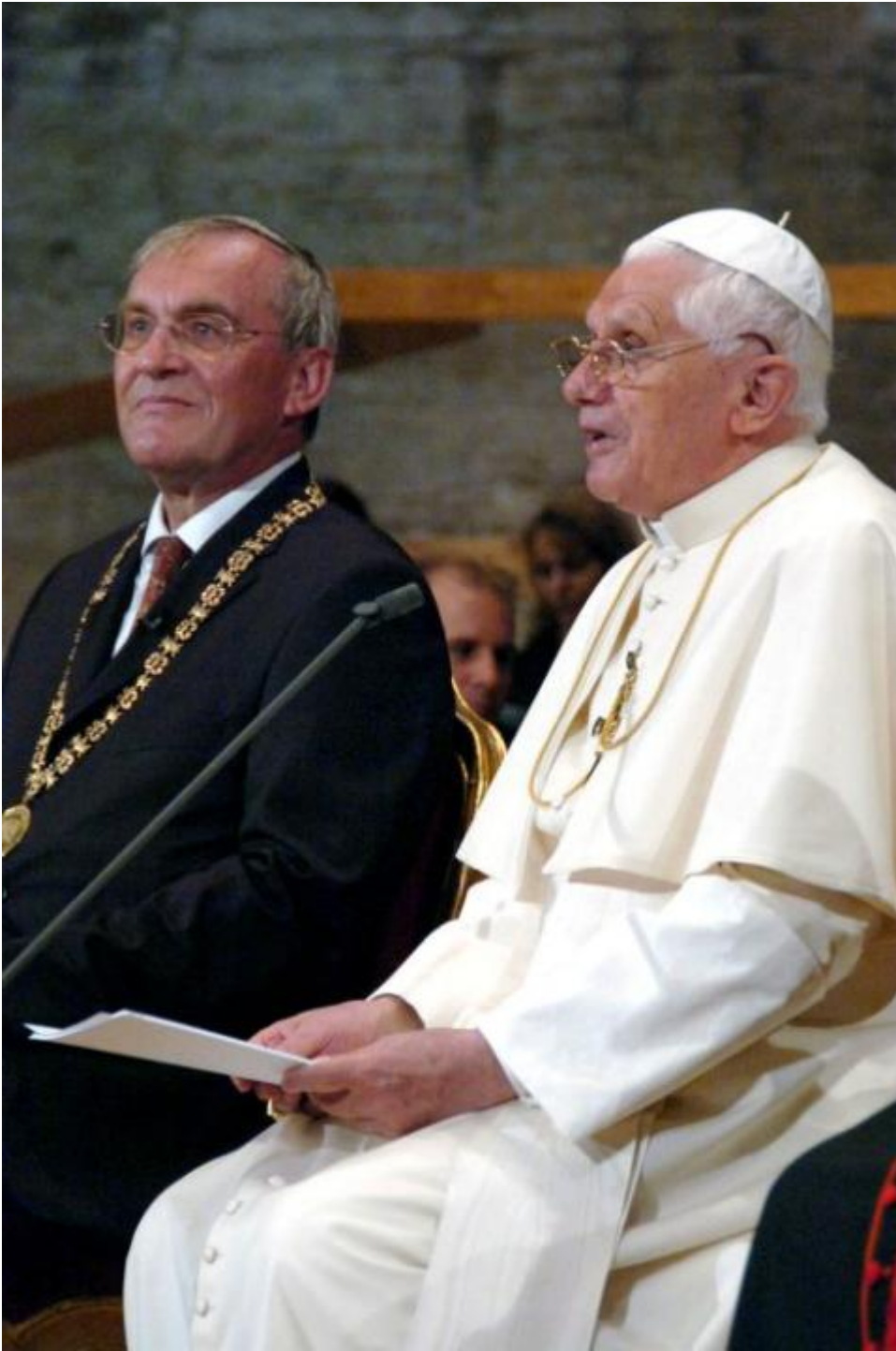
Pope Benedict XVI lectures on faith and reason at the University of Regensburg in Germany Sept. 12, 2006. A quotation from a Byzantine emperor that the pope used in this talk provoked outrage in the Muslim world, but the incident later led to increased dialogue with Muslims.