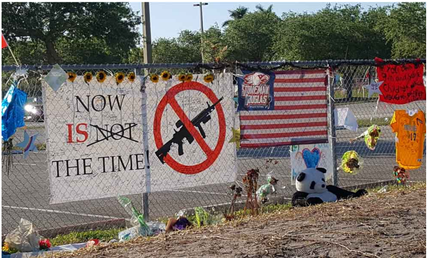
Memorial outside Marjory Stoneman Douglas High School, March 9, in Parkland, Florida