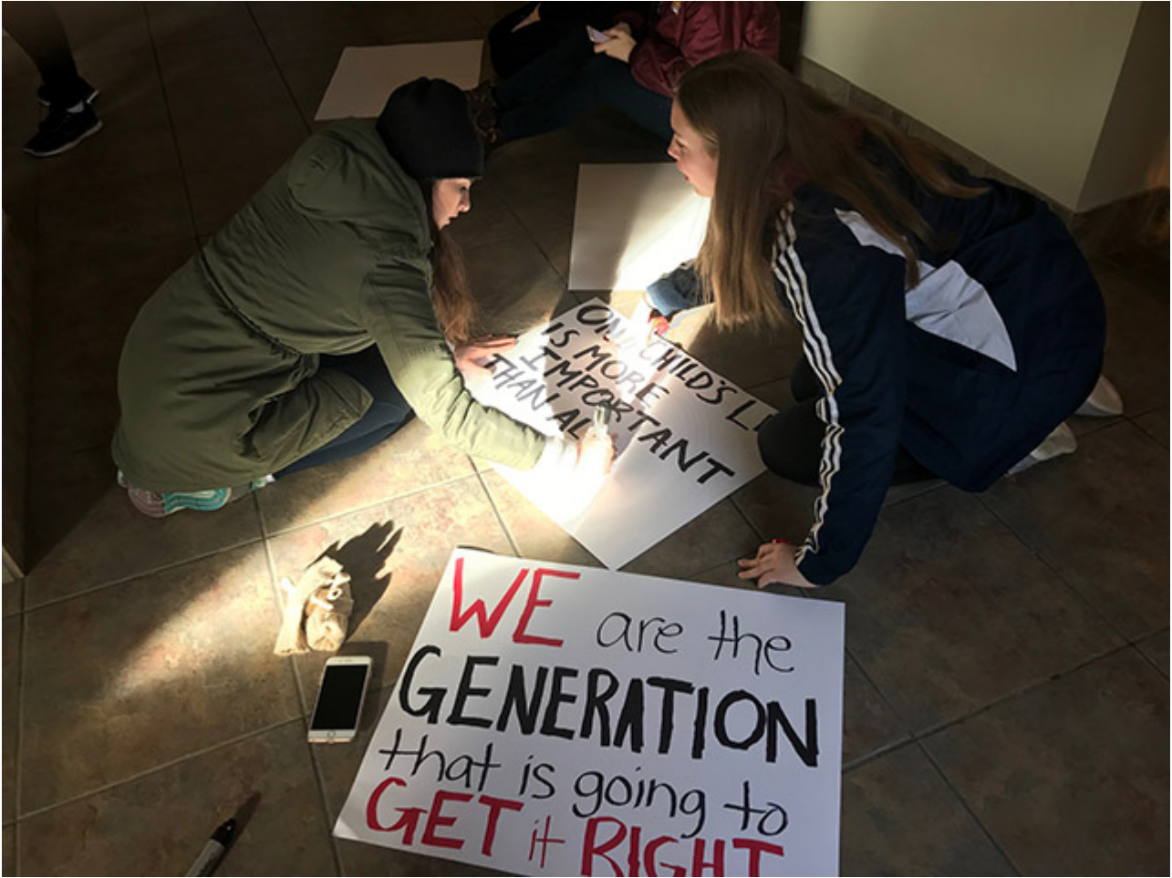
Two Students from St. Joseph Academy prepare signs for the march against gun violence in Cleveland. (Christine Schenk)