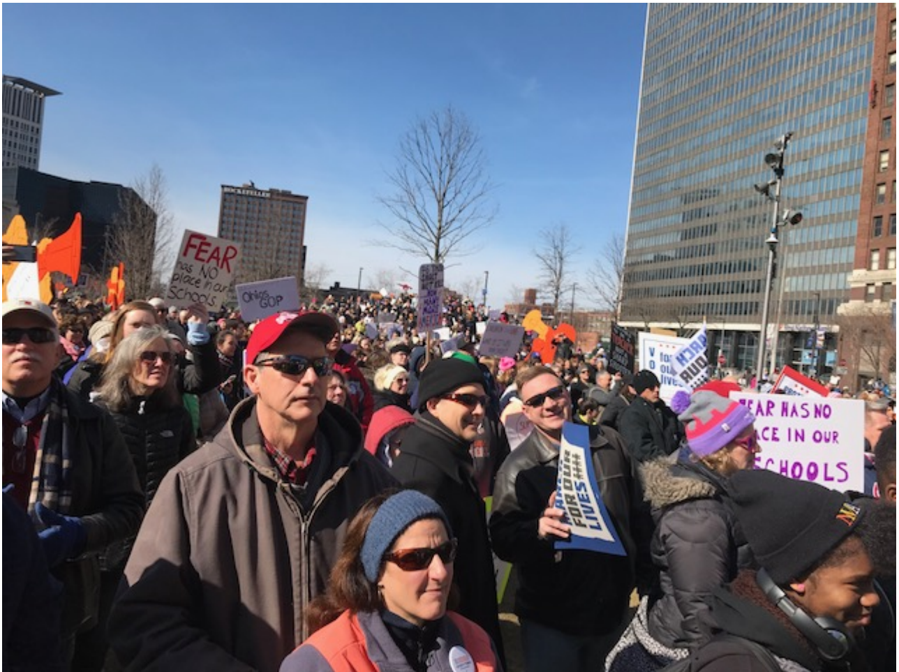
Protesters march in Cleveland, Ohio