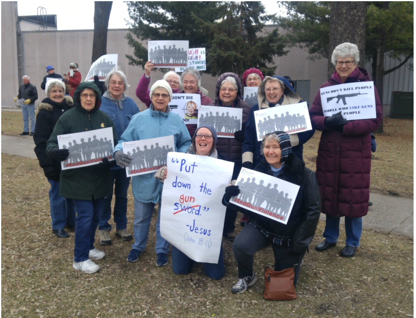
Franciscan Sisters of Perpetual Adoration gather at the downtown March for Our Lives in La Crosse, Wisconsin, while another group of the sisters march in solidarity with the students at St. Rose Convent, the congregational motherhouse across town.