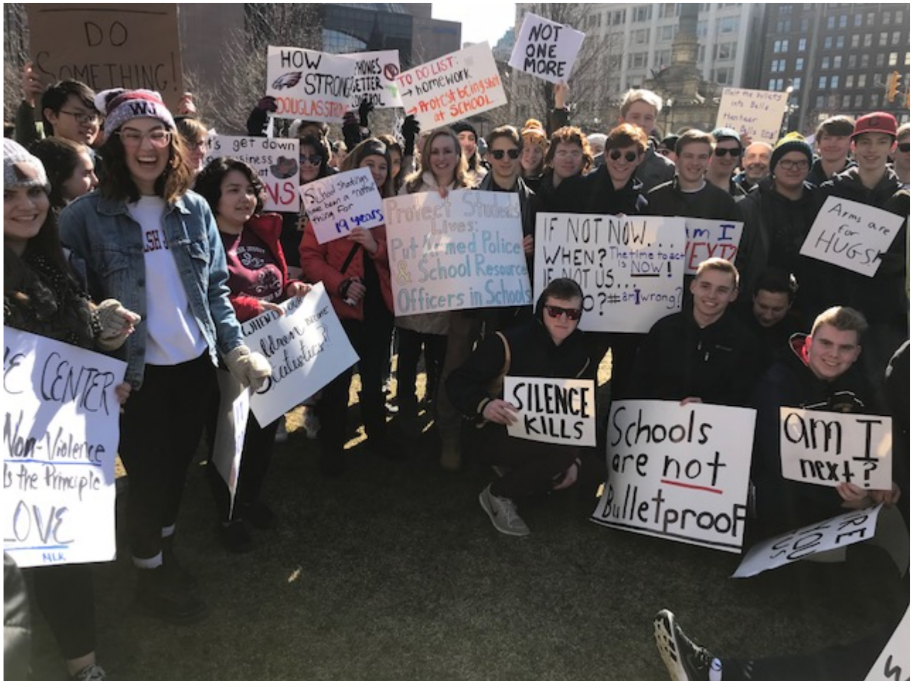
At least 100 Students from Cleveland Catholic schools, including St. Ignatius, St. Joseph Academy, Beaumont, Cleveland Central Catholic, Walsh Jesuit (in Akron), and Magnificat march against gun violence. (Christine Schenk)