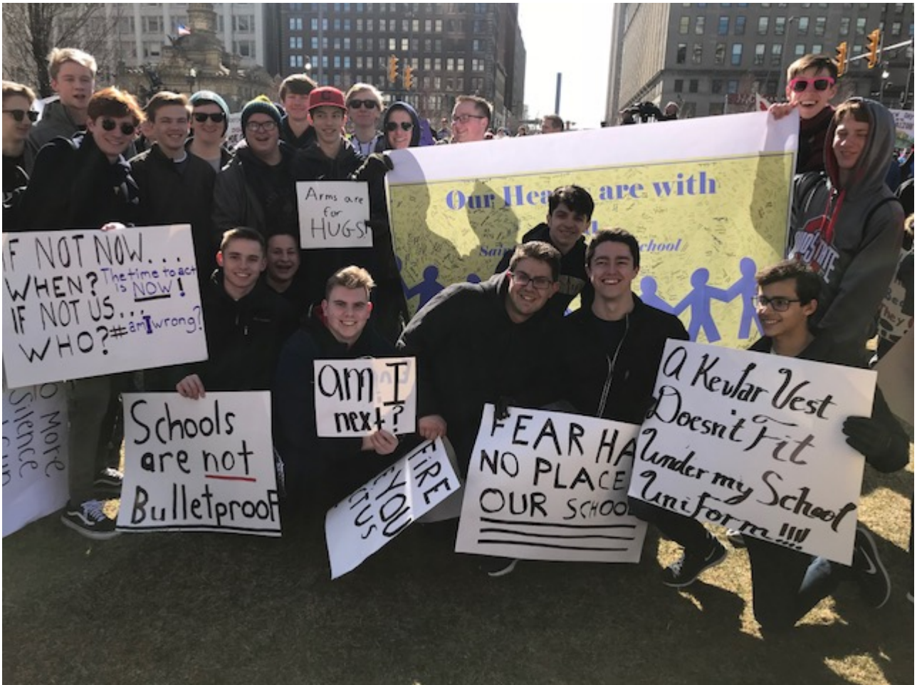
At least 100 Students from Cleveland Catholic schools, including St. Ignatius, St. Joseph Academy, Beaumont, Cleveland Central Catholic, Walsh Jesuit (in Akron), and Magnificat march against gun violence. (Christine Schenk)