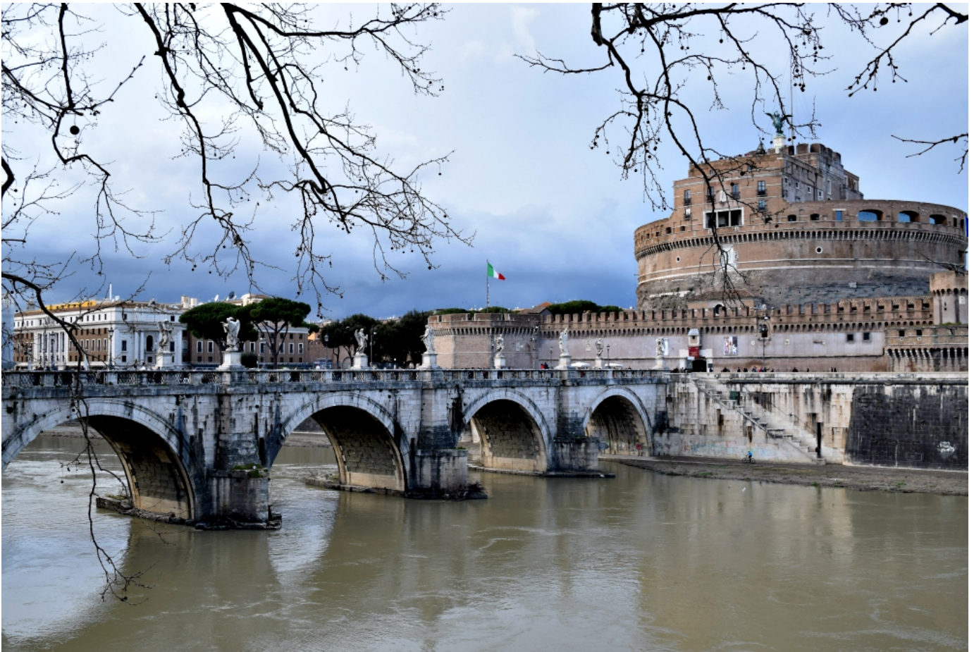
Castel Sant'Angelo is seen from the Tiber in Rome.