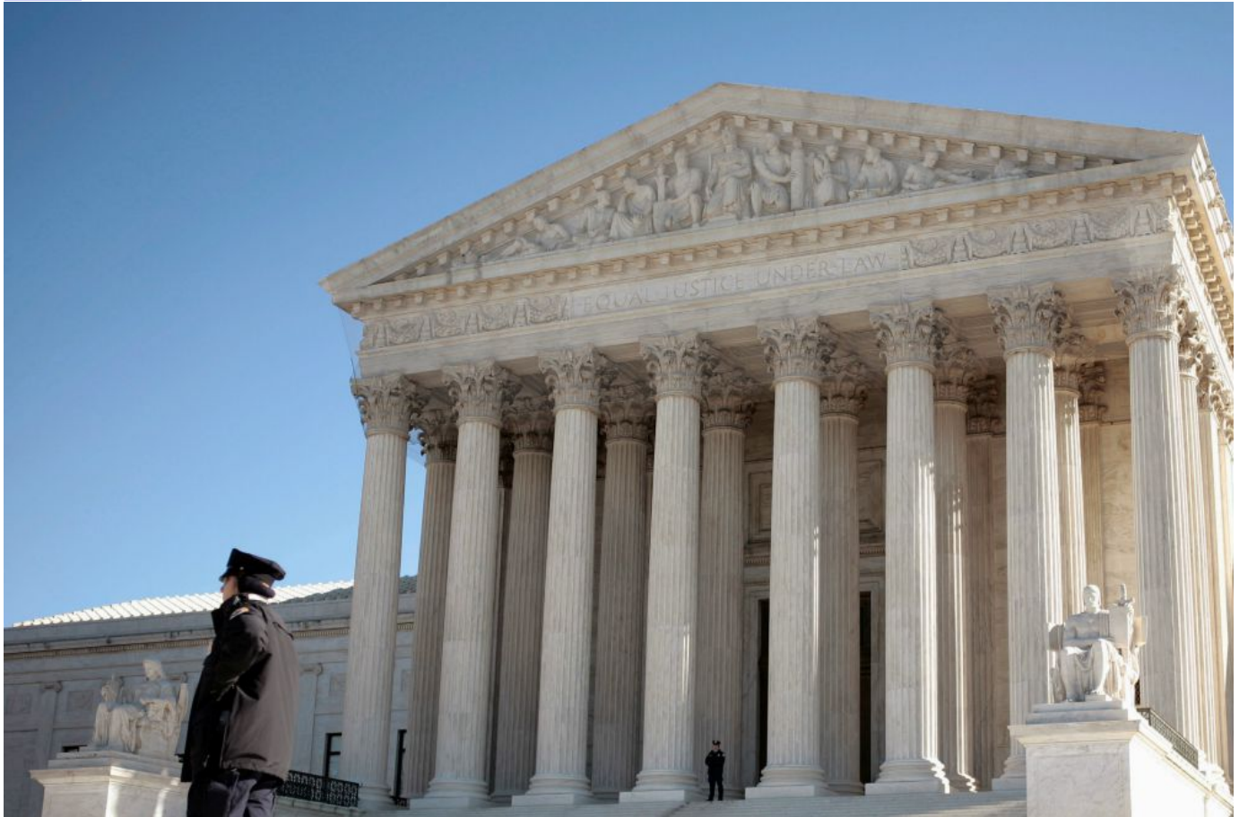
The U.S. Supreme Court, Washington, D.C., March 2017