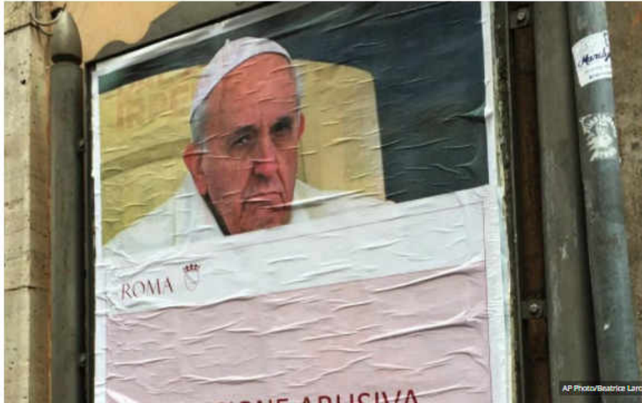
Pope Francis, Cardinal Maradiaga, sex abuse, James Martin, St. homosexuality, Vatican bank, L'Espresso, Catholic News Agency, National Catholic Register