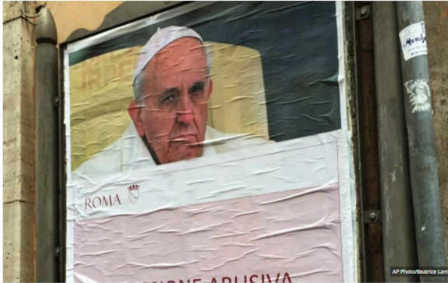
Pope Francis, Cardinal Maradiaga, sex abuse, James Martin, St. homosexuality, Vatican bank, L'Espresso, Catholic News Agency, National Catholic Register,