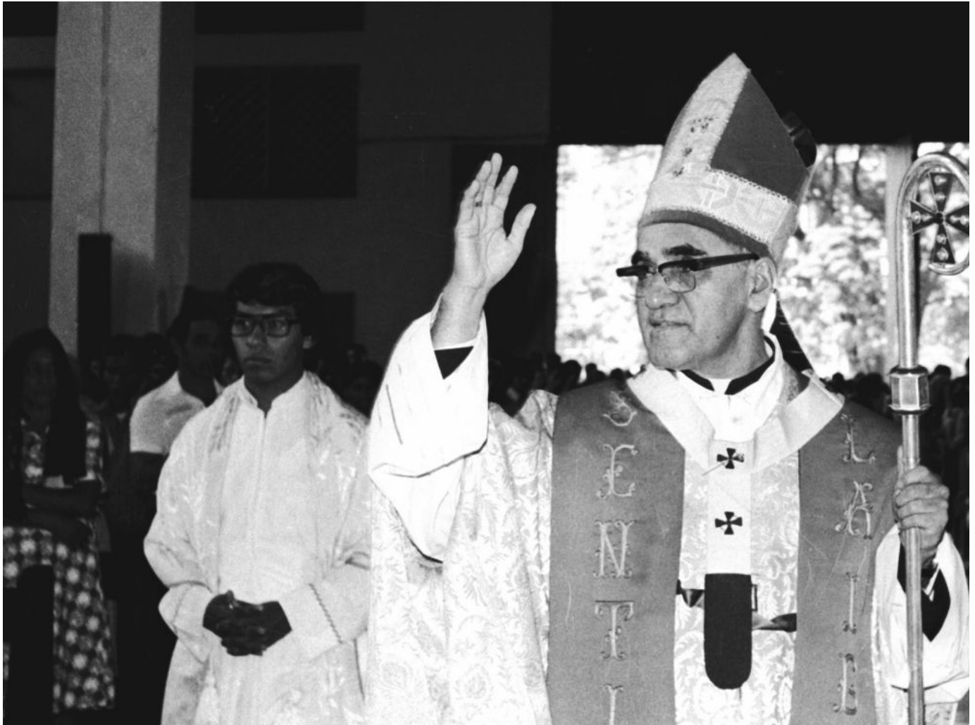
Blessed Óscar Romero is seen in an undated photo.

Romero's canonization comes at a time of incredible violence in the world. Pope Francis has spoken about a third world war, fought piecemeal. What message do you think Romero's sainthood gives to the world about the Christian witness of nonviolence?