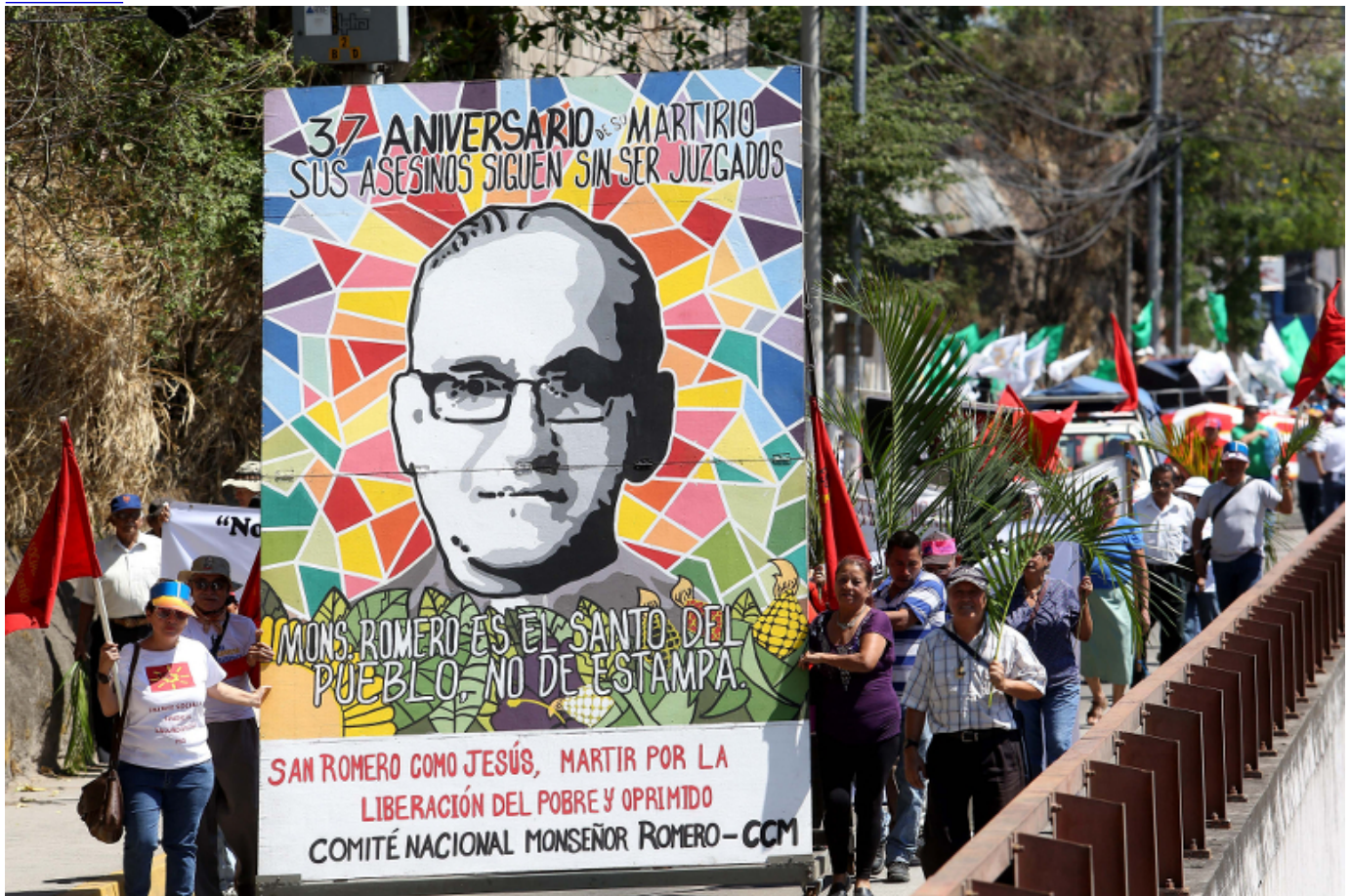
People participate in a 2017 procession to commemorate the 37th anniversary of the killing of Blessed Oscar Romero in San Salvador, El Salvador.