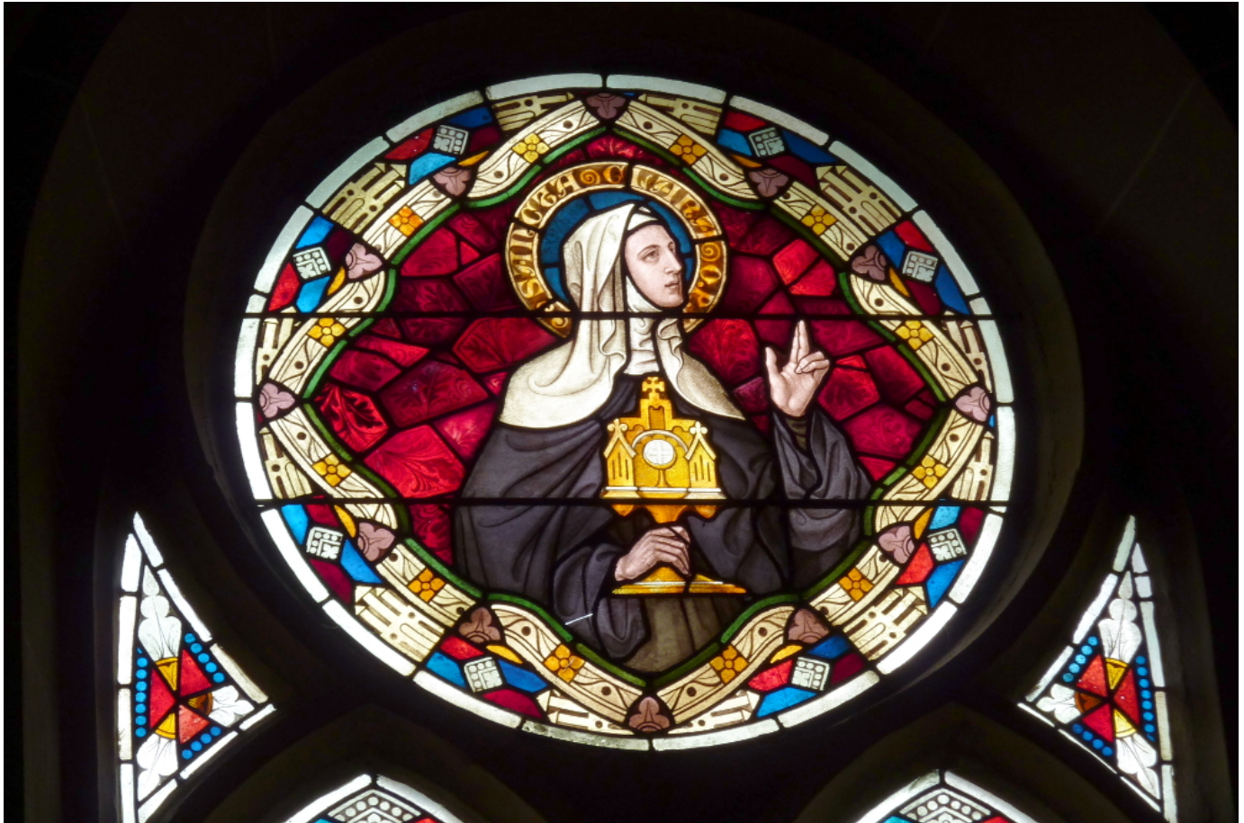
Stained glass window of Clare of Assisi in St. Servatius in Landkern, Germany