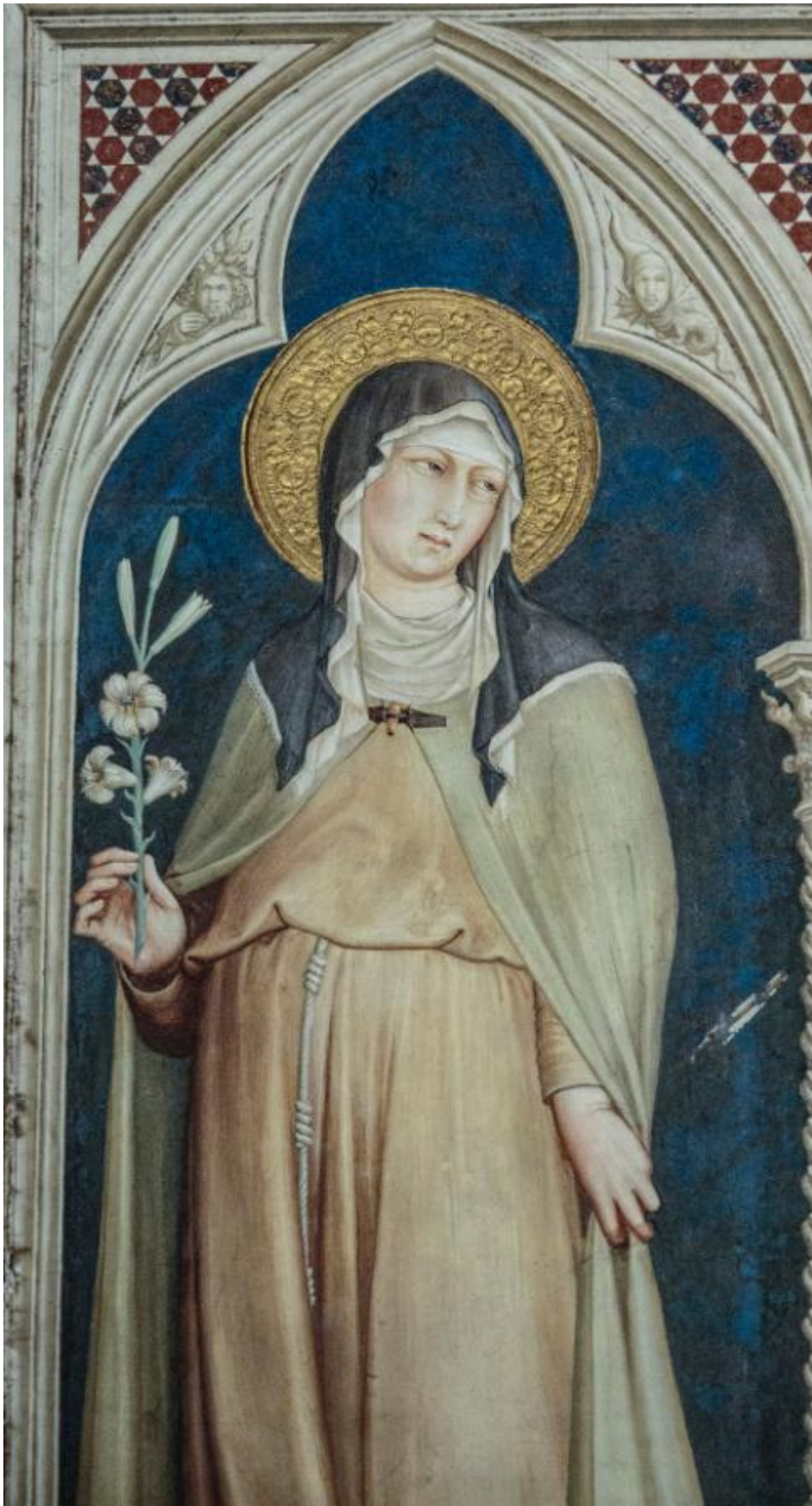
A mosaic in Assisi, Italy, depicts St. Clare of Assisi.