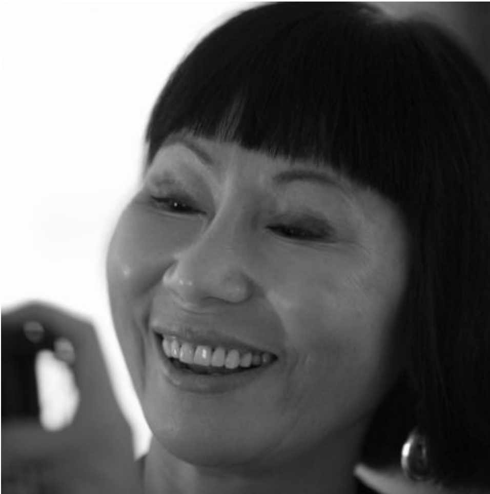
Amy Tan in 2008